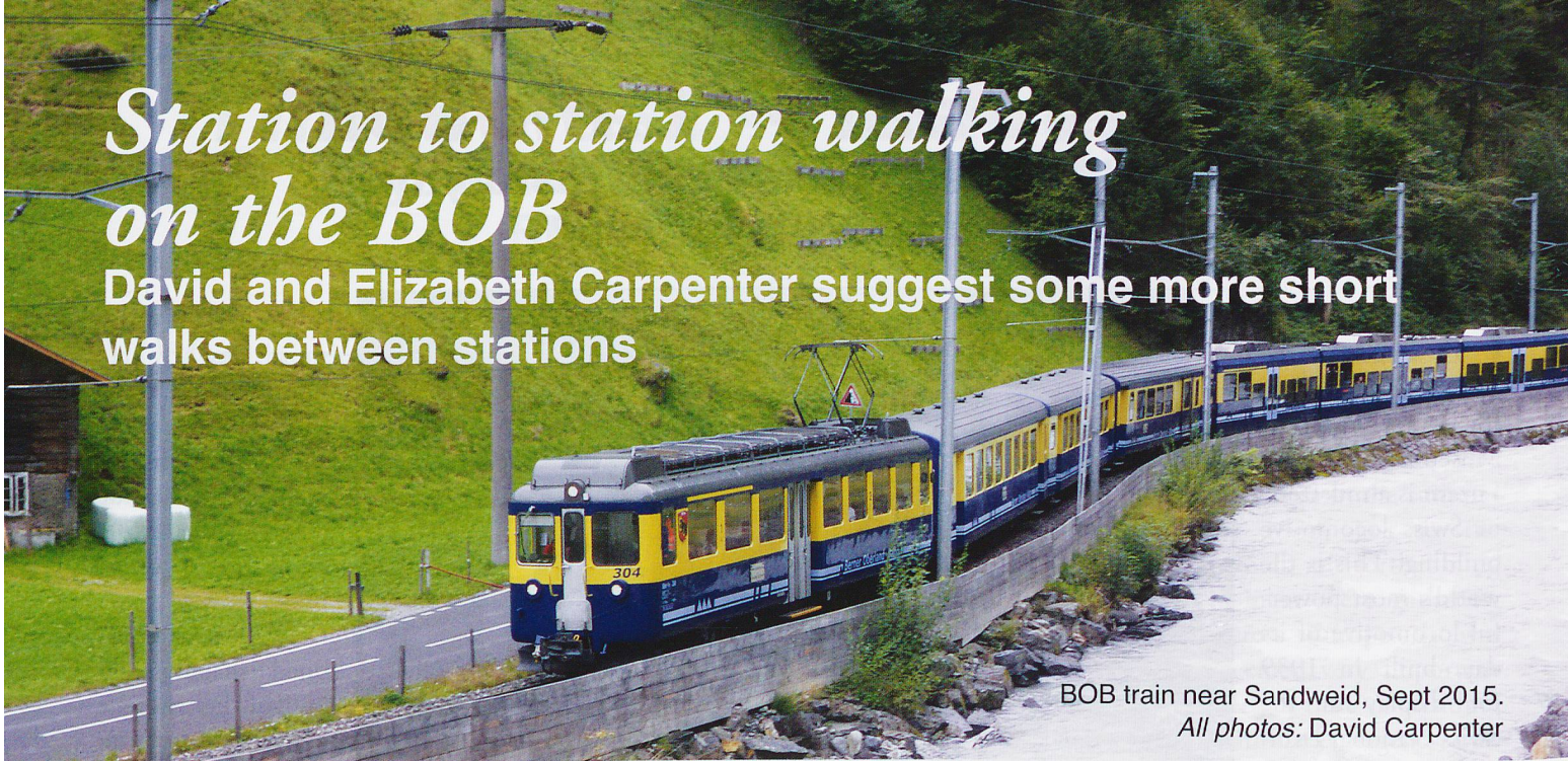
BOB train near Sandweid, Sept 2015.