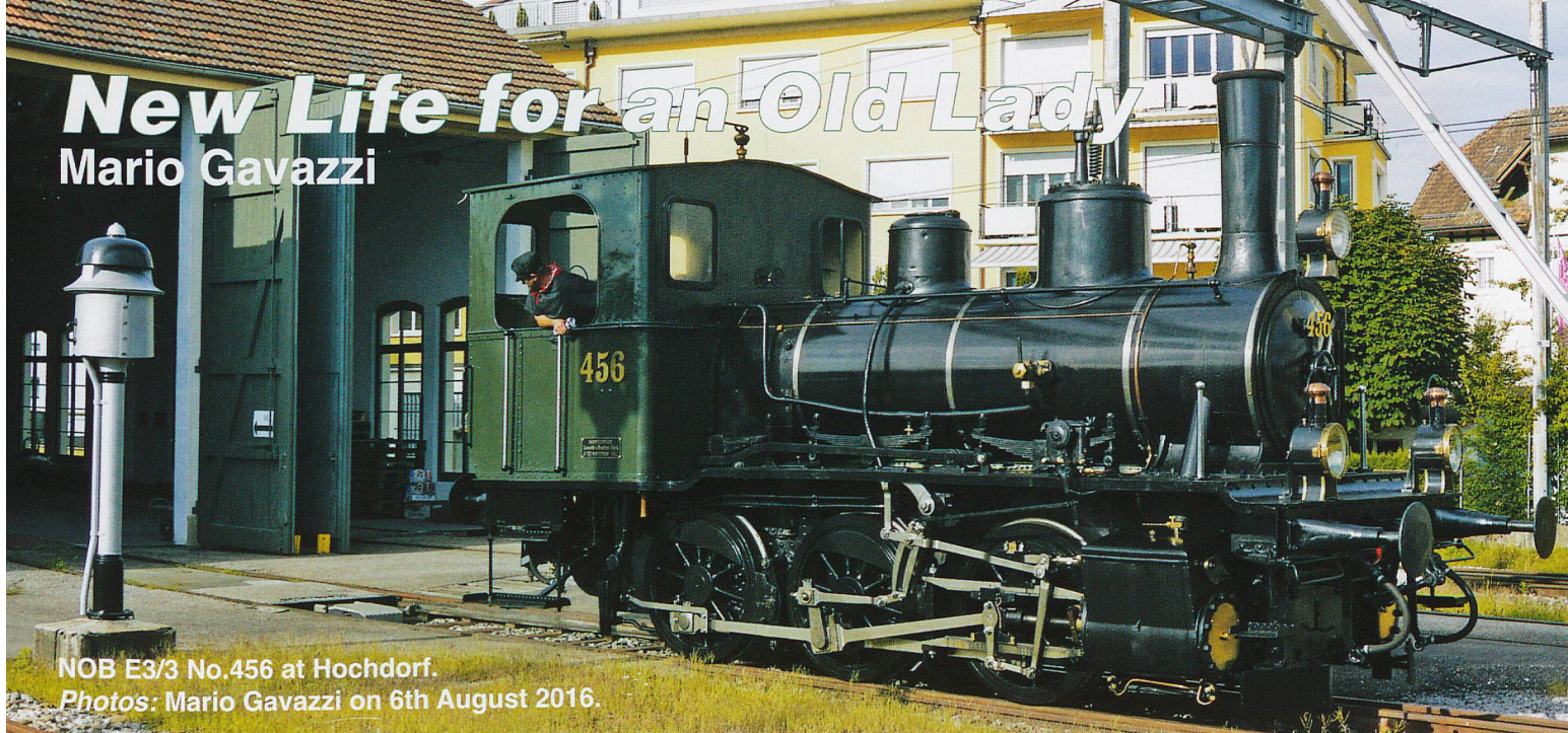
NOB E3/3 No.456 at Hochdorf.

on 6th August 2016.