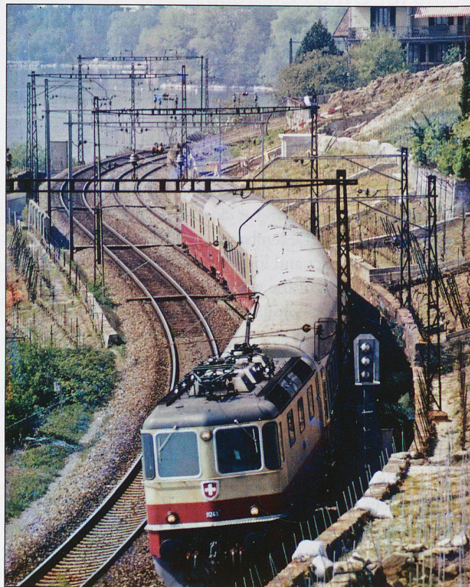
A 'Leman' TEE runs alongside Le Lemon in the early 1980's.

I took the 12.23 Milano-Genève, which was heavily delayed by a fallen tree near Stresa. I reached Genève Airport at 18.29, yet caught the 18.35 flight to Liverpool: a minibus was sent to take me out to the plane!