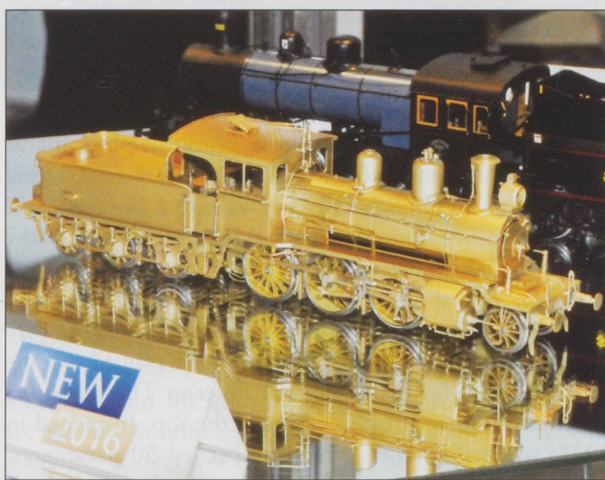
TOP RIGHT: One of the Busch dioramas, showing their industrial system. BOTTOM RIGHT: One of this year's new models from the Swedish manufacturer NMJ. Not only are the models exquisite, I have it on excellent authority that they run very well.