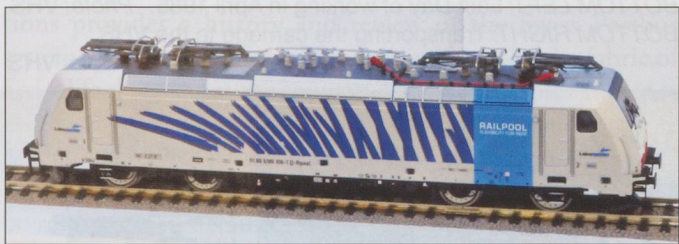
ABOVE: Railpool zebra-striped TraxX loco.

Editor's comment – It is a pity that the bold wording on the Peco stand appeared to be only in English – at a Toy Fair in Germany! However, these days English is the accepted “business language”, so perhaps it is not too surprising. ☒