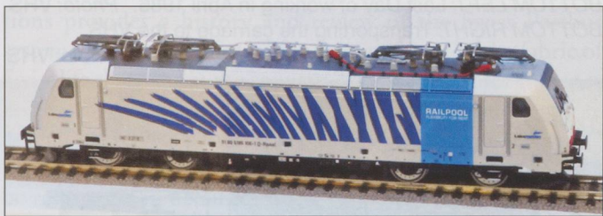
ABOVE: Railpool zebra-striped TraxX loco. TOP RIGHT: One of the Busch dioramas, showing their industrial system.

Editor's comment – It is a pity that the bold wording on the Peco stand appeared to be only in English – at a Toy Fair in Germany! However, these days English is the accepted “business language”, so perhaps it is not too surprising. ☒