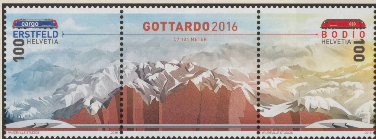
Stamp images reproduced with permission of SwissPost.