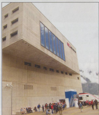
LEFT: The Pollegio control. From here the operations and the safety of the tunnel are controlled.

air conditioning systems boosted to cope with both the heat (up to 45°C) and the humidity of the tunnel, and of course the ETCS 2