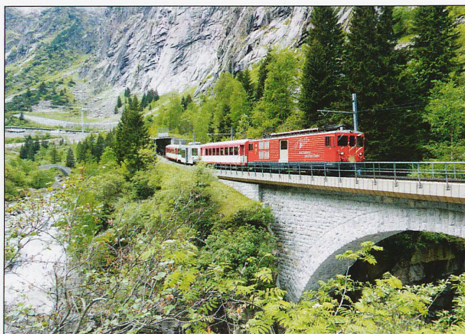
OPPOSITE: An Andermatt bound train passing the Devil's Bridge on 05.06.16.