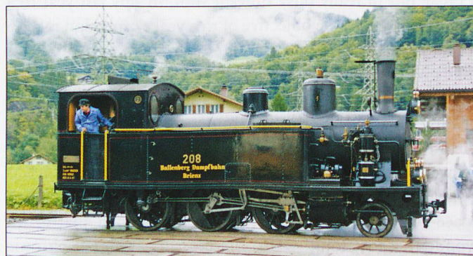
G3/4 208 Ballenberg now back in Service this summer after fire damage and rebuilding.