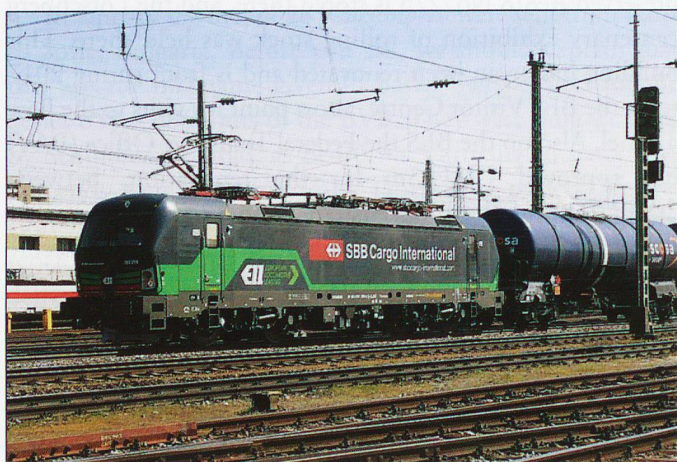
One of the new hirings, 193 259, on a Swiss fuel tank train.

● SBB Cargo International. New 'Vectron' locomotives on order for north-south transit traffic and will be certified for Germany, Austria, Italy and for Switzerland. The locomotives will be ordered by, and leased for 15 years from, a new company, Locrail Holding. This was formed in 2016 by Reichmuth Infrastruktur Schweiz AG, itself a holding of the private bank Reichmuth in Luzern. SBB Cargo International will act as technical partner for ordering, acceptance trials and general rail management.