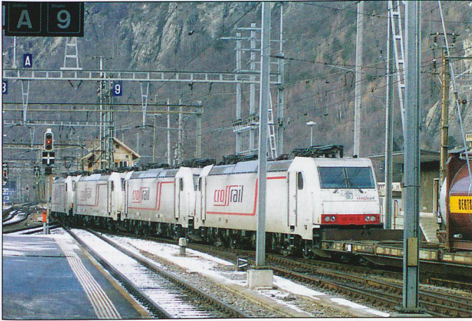
185 580 (Crossrail) and 3 more at Brig. Crossrail used the old Lötschberg line for many trains.

a large part from Switzerland. The locomotives, personnel, and operations, were in February being managed by SBB Cargo (probably on an interim basis), including the extensive banking for DB trains which have used the old Lötschberg line through Kandersteg. Reports suggest that the five Re 430 locomotives will be sold to Widmer Rail Services. The majority shareholder in CrossRail is the German logistics and Rhein shipping organisation the Rhenus Group, which is making no comment.