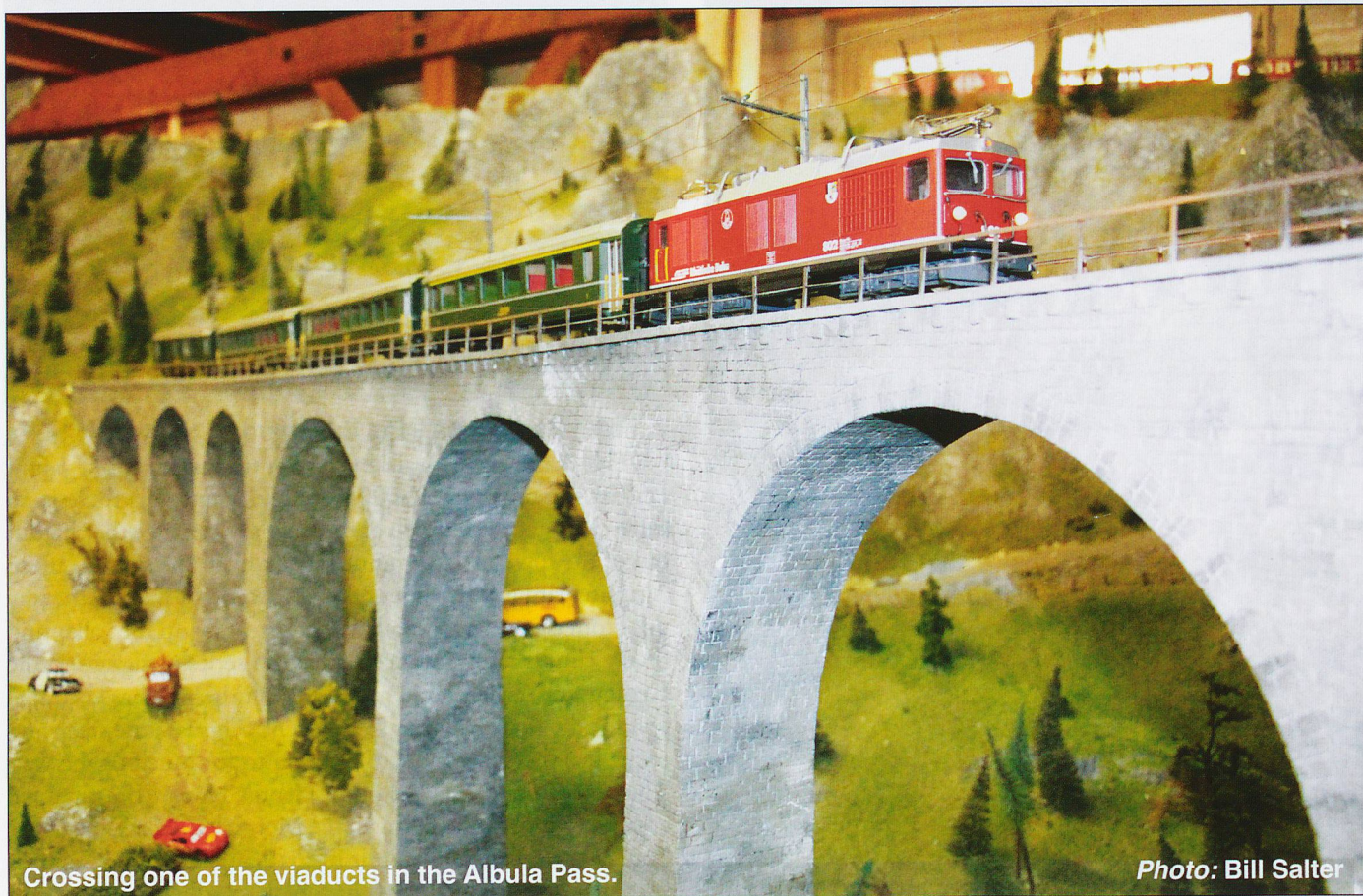
Crossing one of the viaducts in the Albula Pass.