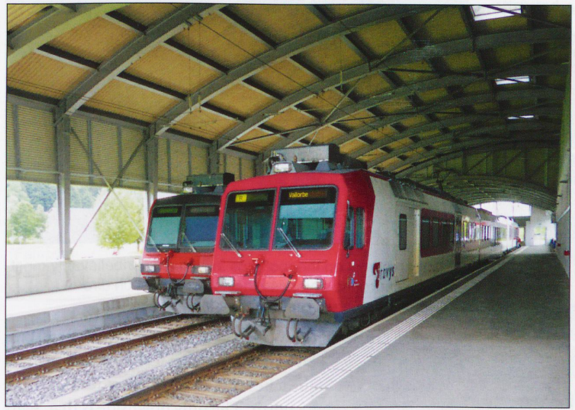
The 12.30 TRAVYS departure to Vallorbe from La Brassus. As can be seen, a very substantial station building in a very rural area, but with severe winter weather.

very short journey to the Lac des Brenets and a short boat trip to the famous Doubs waterfalls. However, as La Locle is close to the French border, it is a stop on the three daily SNCF services to Besancon-Viotte from La Chaux-de-Fonds. There are also three additional M-F peak hour services to the French town of Morteau 9km away. I was able to photograph the 16.18 with the TRN railcar on its left and the RE service to Neuchâtel and Lausanne on the right - my most interesting shot this visit. I returned on a Bern service, changing at Chambrelien to a bus on transN Line120 for a different journey back to Neuchatel.