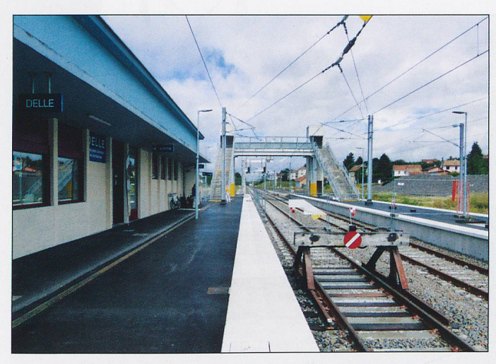
Delle station on the French border on 25 July 2017 with the new extended works for the through services to Belfort, due to start in December this year, clearly seen past the temporary buffer stops. (See 'Swiss News')

sailings, all the lakes have local services and there is also a 3-day/two-night cruise based on Solothurn to all three.