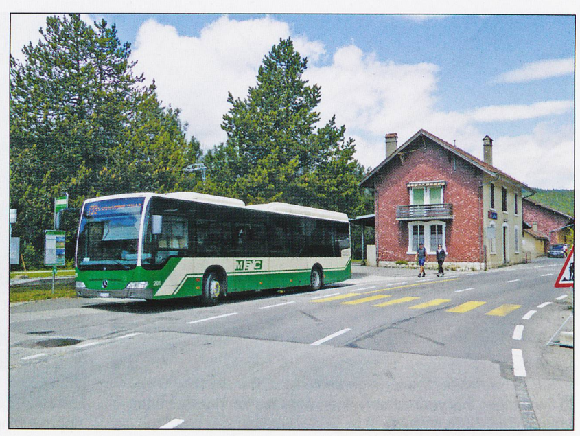
13.40 service from Le Pont MBC route 733 to Cossenay and Morges awaits departure on Sunday 22 July 2017. Again one of only three daily departures.

Again on Sunday 23rd I took Line 630 to Yverdon, then changing onto the twice-hourly Lausanne service to Cossonay-Penthalaz to connect with the Vallorbe line. I have travelled this route on several occasions on TGV services so I thought it would be good to explore. Alighting at Le Day there is the local TRAVYS service via Le Pont to La Brassures. This runs down the Swiss section of the Vallée de Joux, which continues into France. This is a picturesque line that terminates