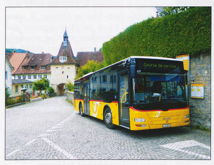
A post bus awaits its next departure at the bottom of the very steep hill to the railway station at St Ursanne.

On Tuesday, from Gorgier I travelled to Neuchâtel, Biel/Bienne then onward via Delémont to Delle just over the border in France. Its recently rebuilt station was only partly open, as the reconstruction of the line to Belfort was still in progress - completion scheduled for end 2017. Returning to Switzerland I alighted at St Ursanne, where there is a very steep hill down to the town. This is served by oddly timed buses there is a 2-hour gap between 14.00 and 16.00. Guidebooks claim this is the most complete medieval town in Switzerland and I can see why. I also found a brewery,