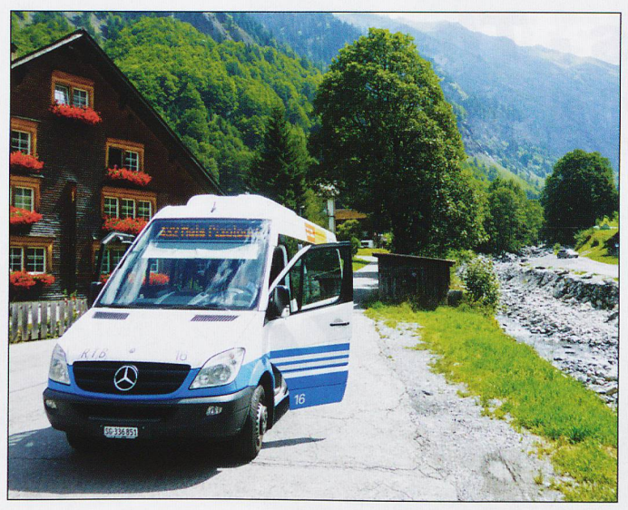
Weisstannen with the hourly service 432 awaiting departure at 13.42 to Sargens.

Remarkably an English guidebook is available. Returning home I consider that my Swiss Pass was both put to good use and excellent value for money.