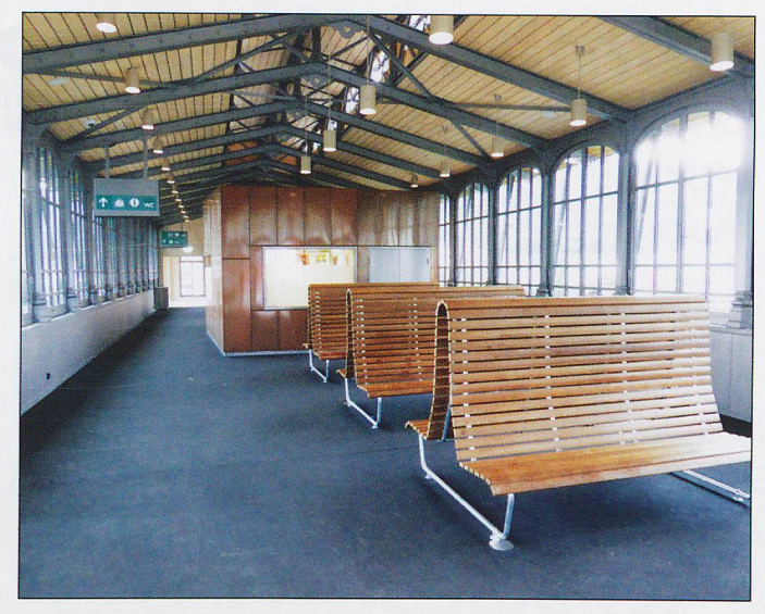
If you have not been to Arth-Goldau in the last few years you will not have seen the rebuilding of the base station for trains to the Rigi. Well this is where you used to board, but the rebuild has put the trains out at the southern end and this is now a very grand station entrance hall. Unfortunately the two new platforms are no longer under cover!!

Remarkably an English guidebook is available. Returning home I consider that my Swiss Pass was both put to good use and excellent value for money.