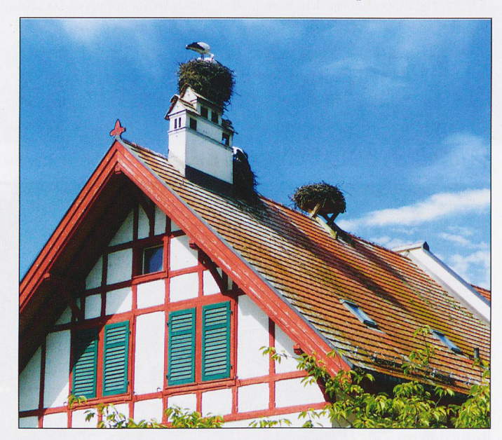
European storks on the roof tops in Uznach. Unbelievably most stay all year round and raise their young on such dire locations. They are a great feature in this town.

On Thursday 27th I left the Jura to stay with friends in Kaltbrunn, near Uznach (famous for its storks) at the eastern end of the Zürichsee. On Saturday, a clear alpine summer day,