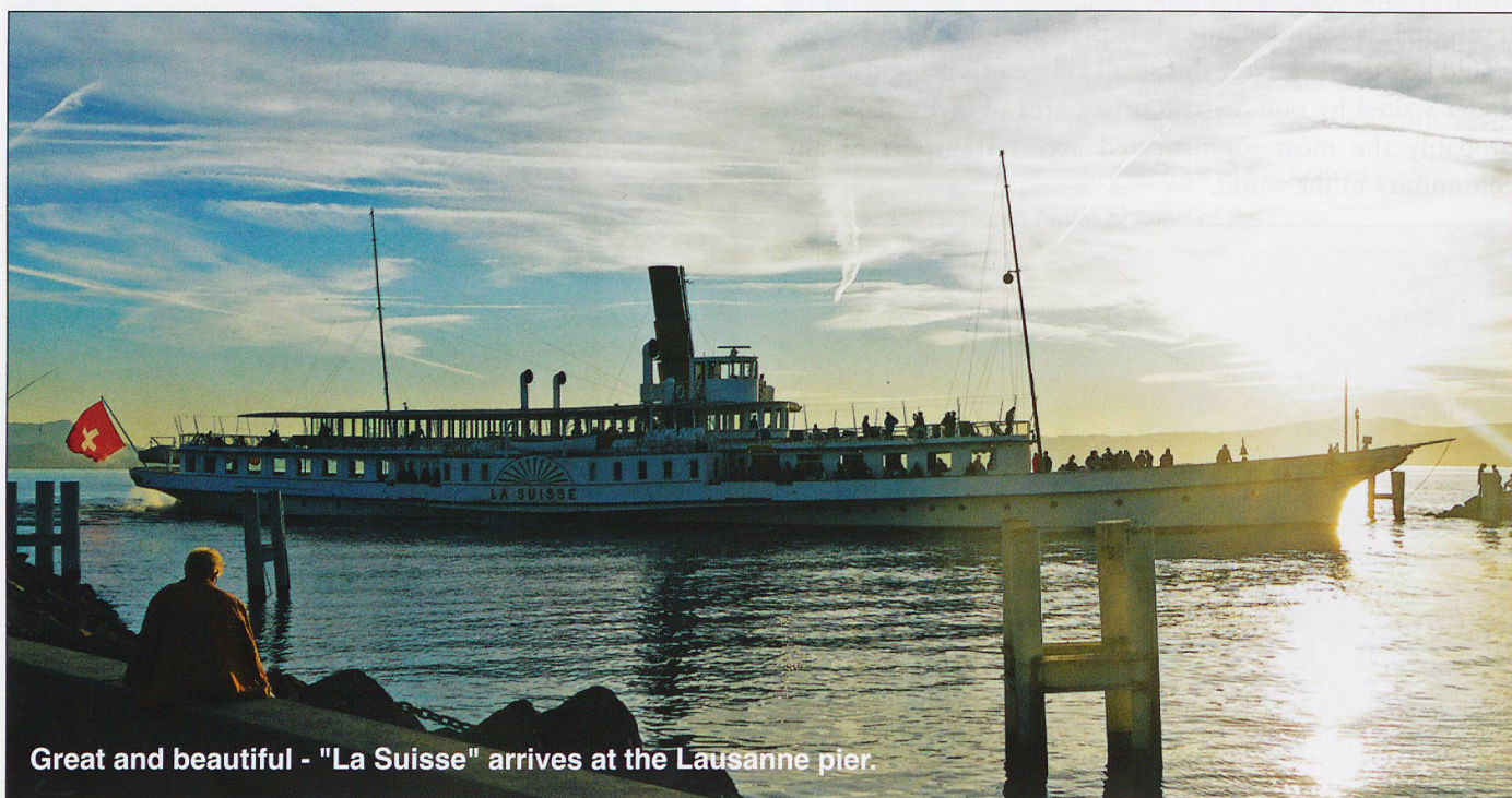
Great and beautiful - "La Suisse" arrives at the Lausanne pier.

private cars. But some of them must be lucky people - for example some of those who commute by ship across Le Léman between Lausanne and Evian-les-Bains in France. This is a busy two-way traffic as many French and Swiss travel daily in both directions to their jobs. It must certainly beat the overcrowded 07.15 from Olten - or the 08.00 from Surbiton! The Compagnie Générale de Navigation sur le Lac Léman, www.cgn.ch (CGN) normally operates large motor ships between the two cities. On their other international lines CGN uses small fast ships, but between Lausanne and