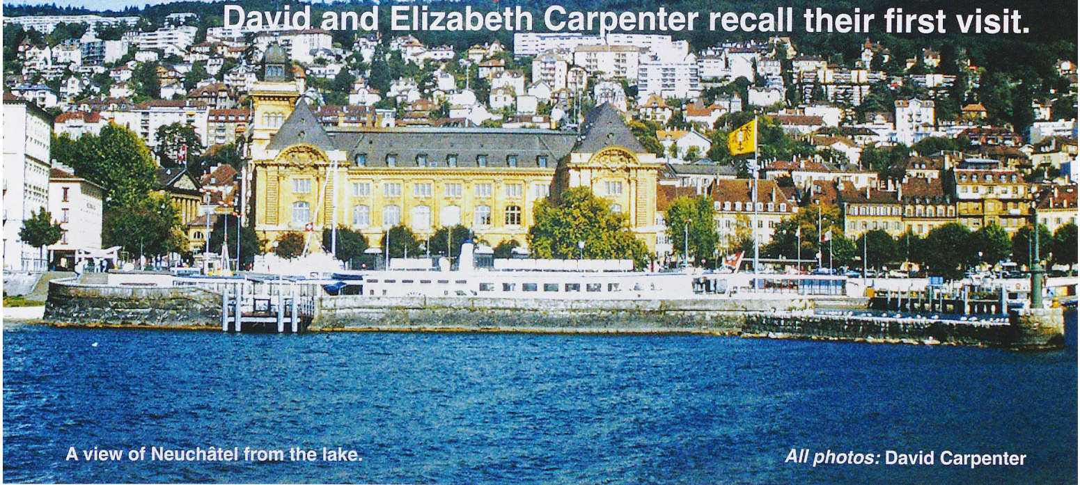
A view of Neuchâtel from the lake.