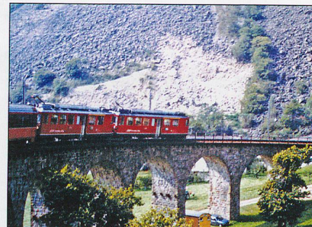
Brusio circular viaduct.

restaurateurs were out on the streets offering lunch to arriving passengers from the train - "We serve you very quick!" - we settled for ice cream from a stall in the square. On our last day we took the train, at the time comprised of motor