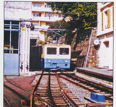
Lausanne Metro train arriving at Ouchy - now all changed!

noticed a little green and yellow train running alongside the lake and vowed to do this, the TN line to Boudry, later. Returning to Neuchâtel we rode the trolleybus to La Coudre and the funicular to Chaumont (see SE No.131). Back then it was a conventional counterbalanced operation with two-cars, unlike today's single-car system, and it was at the top that we first heard cowbells! From Neuchâtel we took a trip to Lausanne where we rode the Metro one-stop up to Flon. All has now changed with the introduction of the modern M2 automatic Metro system, but at the time the line ran in a double-track tunnel that in fact housed two single lines. One was for the unit that shuttled between the Gare CFF and Flon, and the other for the loco plus two