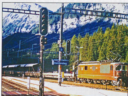
A BLS Lötschberg tunnel shuttle train at Kandersteg.

which we accomplished at Kandersteg. One was to buy a cuckoo clock, which we still have, and the other was to go to the Jungfrauoch. Other members of the group warned us "It costs mega-bucks to go up there, so only do it if the weather is fine". We decided to do it anyway and were not disappointed. If we still needed any confirmation that the Swiss spoke good English, it came at Interlaken Ost.