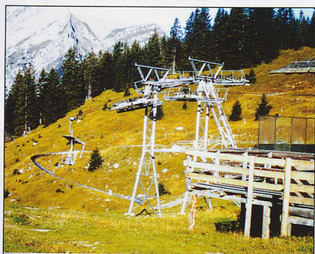
Old Oeschinensee chairlift at the top station.

finding it more like our imagined Switzerland than Neuchâtel. Following our tradition of not going too far on the first day at a location, we took the old chair lift up to Oeschinensee. It was a relaxing experience to be