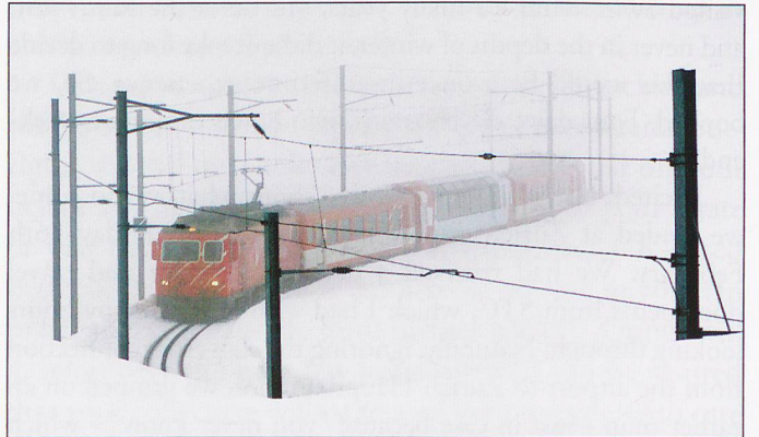
A Glacier Express about to enter the tunnel at Untere Rufenen.

The highlight of our second day was a ride on the Glacier Express to St Moritz. This was scheduled for just before noon so there was time for an hour's walk in the snow alongside the River Reuss. A glorious morning; sunny; clear air; blue skies; sparkling snow - but a freezing cold wind blowing down the valley towards us. We boarded our train No.7, the Glacier Express , and arrived at St Moritz five hours later. A long journey on the slowest express in the world (average speed 36kph) but what a route - a winter wonderland and a journey we won't forget in a hurry. We listened to the on-board commentary at every opportunity not wishing to miss anything of interest, although our eyes stayed glued to the incredible scenery for the whole journey - apart, of course, when we were eating lunch! Leaving Andermatt the route snakes its way up four half-spirals, three of which are in tunnels before reaching Nätschen then climbs to the top of the Oberalp Pass at 2,033m. From the pass, the train descends, still on the