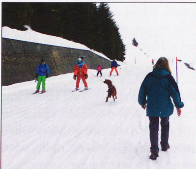
Some skiers and their dog enjoy the conditions at Oberalp pass.

One of the advantages of being retired is that I'd had chance to wonder what we were going to do with our "spare time" - in other words, when we weren't on a train. Our hotel was at the bottom of the Oberalp Pass road, which is closed to traffic in winter to become a skiing, tobogganing and hiking route. Being keen walkers, we quickly checked-in and set off up the road to Nätschen where we could catch a train down. You might be thinking, why didn't