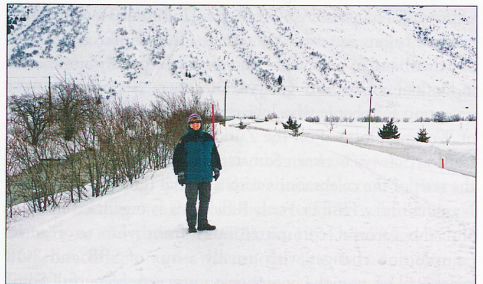
The very snowy River Reuss walk.