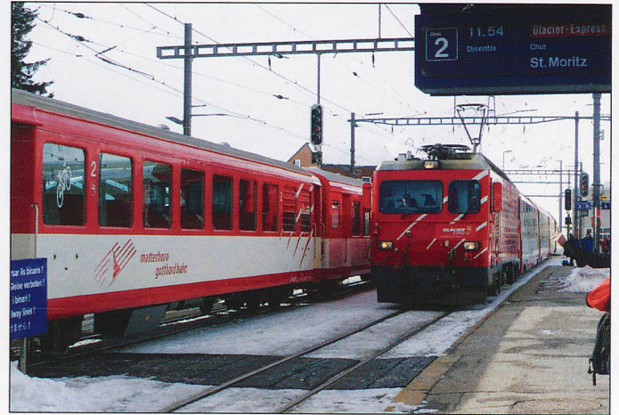
Our Glacier Express arrives on time at Andermatt.

UNESCO World Heritage Site and is described, quite rightly, as one of the railway engineering wonders of the world. Finally, on past Samedan before reaching St Moritz where we boarded the regional train (our No.8) for the ten-minute ride to Pontresina and our hotel. It started to snow quite heavily in the evening. "All the better for tomorrow's excursion on the snow blower!" Day Two over. One walk, but only two trains!