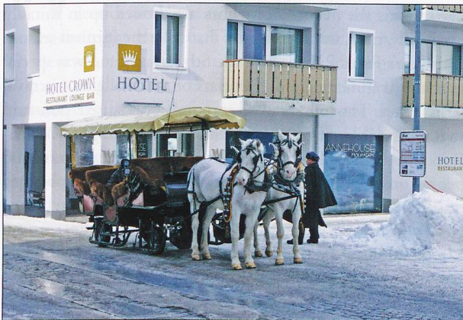
An older and more leisurely form of transport at Andermatt.

rack, to the first village on the Rhine, Tschamut-Salva, continuing down to Disentis and along the unspoilt Rhine Gorge (Switzerland's "Grand Canyon") to Chur. Next, the train retraces its steps for a few miles before turning south towards St Moritz. The journey from Chur was incredible with views of distant castles and, way below, the Schyn ravine and turbulent Albula river. Soon after Tiefencastel the famous 90m high Landwasser Viaduct, with its six arches, came into view. Cameras had been at the ready well before the approach; in fact, they had been at the ready for the entire journey - just a shame about the reflections from the panoramic windows.