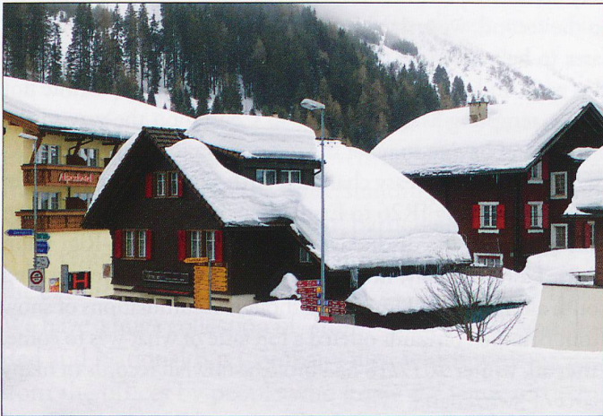
The severity of the winter snows is obvious by the depth on the roofs at Andermatt.

is the problem? The RE pulled into Göschenen on time (15.02) where we found Platform 1 was next to Platform 11 allowing oodles of time to get on the 15.04 MGB rack-unit to Andermatt. Train No.5. Ten minutes later, after travelling through the narrow Schöllenen Gorge alongside the River Reuss and passing the famous Teufelbrücke, we pulled into Andermatt - cold and dry with over one metre of lying snow. Our first real taste of Switzerland in winter.