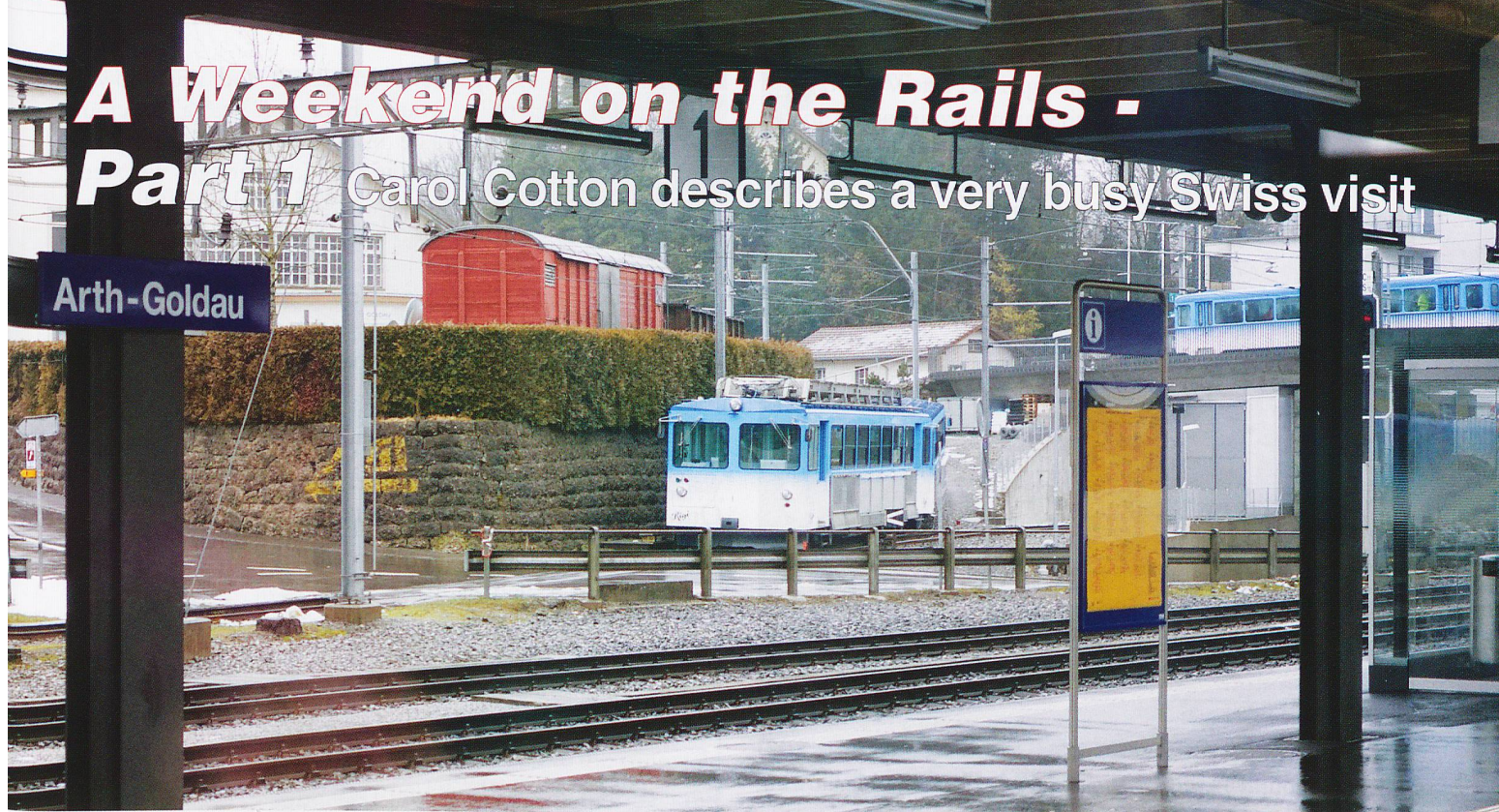
ARB trains wait at Arth-Goldau.