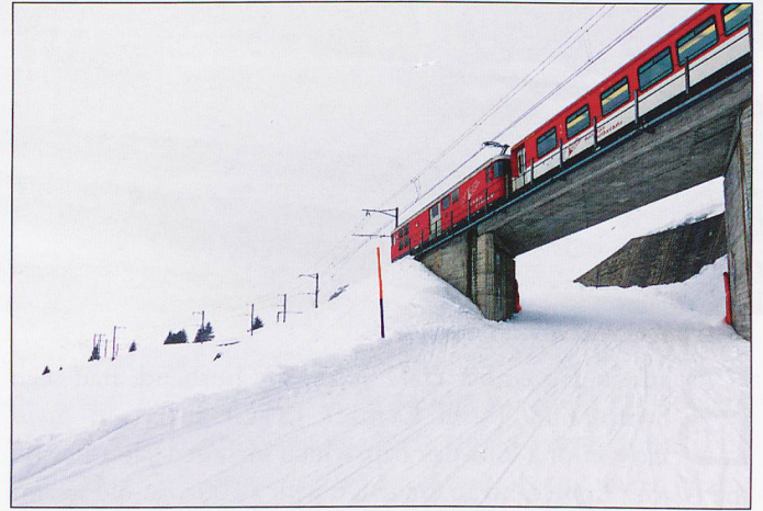
MGB Deh 4/4 No24 crossing Oberalp Pass at Falken.

they take the train up the 400m climb and walk down? Waiting for the train would have lost us a precious 30-minutes of daylight. The 6km route up to Natschen closely follows the railway line and, although we were soon walking through low cloud, we did get fleeting glimpses of village and mountain and of course, passing trains. Nätschen is a request stop so I pressed the button accordingly, then a train appeared right on time but didn't slow down! "Are you sure you pressed the button?" As it passed we saw it was the Oberalp pass car transporter taking vehicles between Sedrun and Andermatt. Checking that the request button was still active a couple of anxious minutes passed before our train (No.6) arrived; neither of us fancied an hour's walk back down the mountain in the dark. Day One over. One plane, one walk - and six trains!