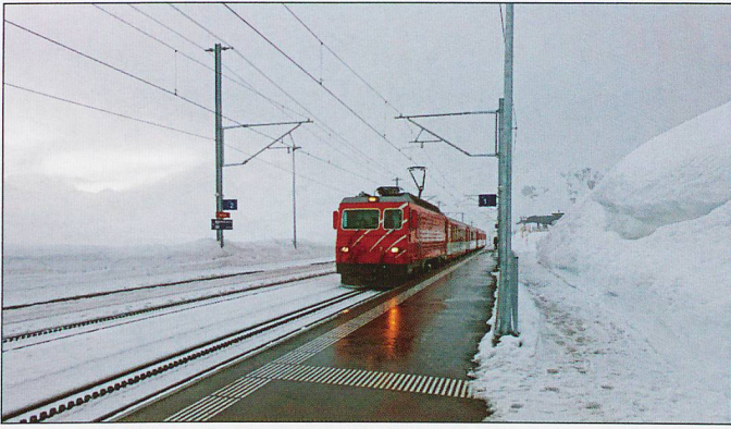
Regio 856 leaves Natschen.

rack, to the first village on the Rhine, Tschamut-Salva, continuing down to Disentis and along the unspoilt Rhine Gorge (Switzerland's "Grand Canyon") to Chur. Next, the train retraces its steps for a few miles before turning south towards St Moritz. The journey from Chur was incredible with views of distant castles and, way below, the Schyn ravine and turbulent Albula river. Soon after Tiefencastel the famous 90m high Landwasser Viaduct, with its six arches, came into view. Cameras had been at the ready well before the approach; in fact, they had been at the ready for the entire journey - just a shame about the reflections from the panoramic windows.