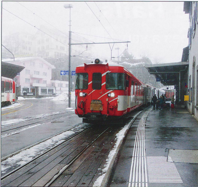
A wet scene at Goschonen.

is the problem? The RE pulled into Göschenen on time (15.02) where we found Platform 1 was next to Platform 11 allowing oodles of time to get on the 15.04 MGB rack-unit to Andermatt. Train No.5. Ten minutes later, after travelling through the narrow Schöllenen Gorge alongside the River Reuss and passing the famous Teufelbrücke, we pulled into Andermatt - cold and dry with over one metre of lying snow. Our first real taste of Switzerland in winter.