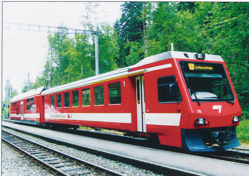
TOP: Combe-Tabeillon station showing the trailer end of the train.