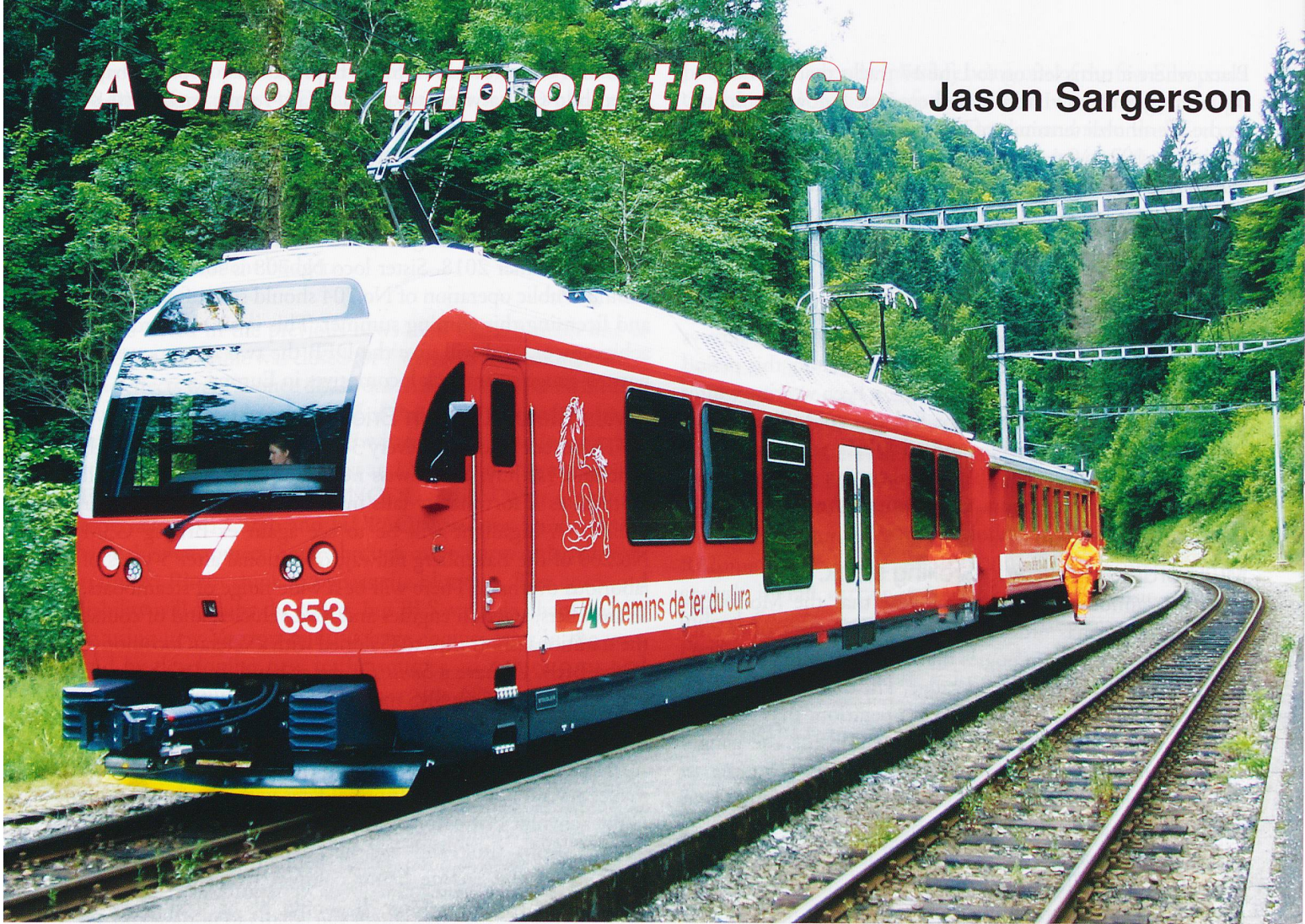
The driver changes ends at Combe Tabeillon.