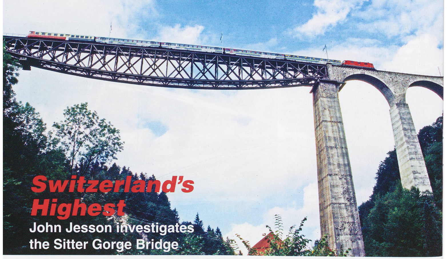
The bridge is more dramatic from the level of the river. The southbound Voralpen Express is worked by an SBB Re 4/4 and has a mismatched driving trailer leading the formation.

t is, perhaps, a little surprising to find that the highest bridge in Switzerland is not in the high Alps, but in the northeast of the country. It was also not built by one of the SBB constituent companies, but between 1908 and& 1911 by the standard gauge Bodensee-Toggenburg Bahn. This railway became part of the Südostbahn in 2001, and its landmark structure is situated just a short distance from St Gallen, crossing the deep gorge of the River Sitter. The actual 120m long inverted bowstring girder bridge is actually the central span of a 365m long viaduct, the majority of which is a series