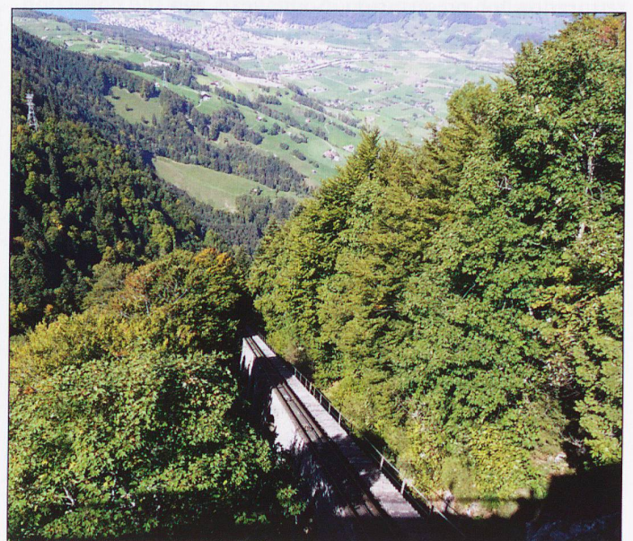
RIGHT: The signs still point to the old dis-used funicular.