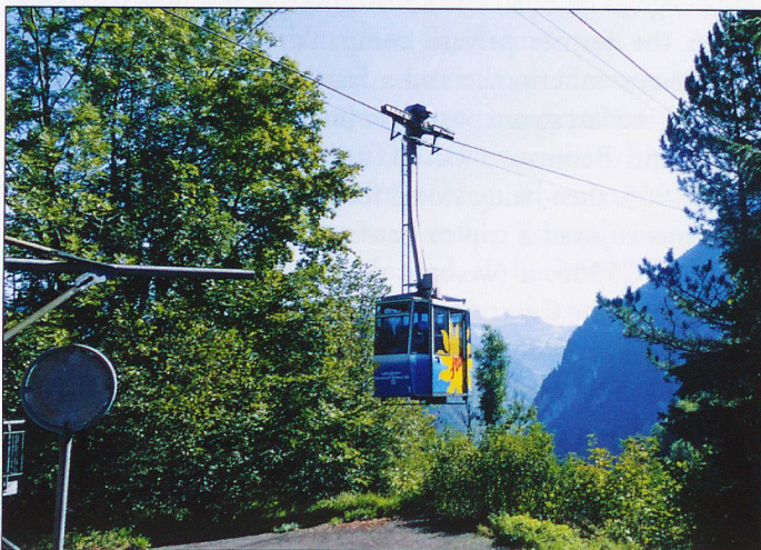
ABOVE: The cable car that we unexpectedly arrived at – definitely not the new funicular.

the 'nouveau', or 'neu', funicular. Eventually we risked riding up using our Swiss Pass, which fortunately turned out to be valid when we reached the manned top station. Explaining that we wanted to walk to the new funicular, we were given tickets and off we went. Stoos was very quiet, with the various buildings well spread out on the mountain, not the expected 'old-world' Swiss mountain village. There was the usual plethora of Wander Weg signs, some pointing to the funicular. The next problem was that they sent us to the old funicular! We could find no signs at all to the new one and the large maps on display weren't of any use in locating the multi-million franc construction. Eventually, having walked