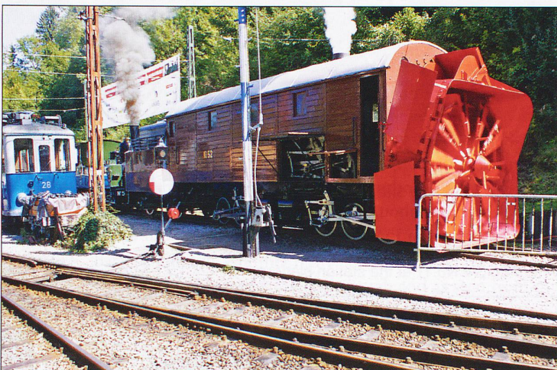
RhB No.9214 Xrotd 6/6 rotary snow plough, with the plough rotating, hence the railing in front.

others, I found that due to French air traffic controllers playing their usual games many flights were cancelled. I was pleasantly surprised that Easyjet offered me a one night stay in a four-star city centre hotel, a dining voucher for the hotel, and a 24-hour Geneva local transport pass. As I had no commitments the following day I re-booked on a late flight back to Gatwick and spent a pleasant few hours sampling the impressive Genève tram network. I was delighted to see trams on Line 18 showing their destination as "CERN" – a tramcar to the Large Hadron Collider, splendid! 🇨🇭