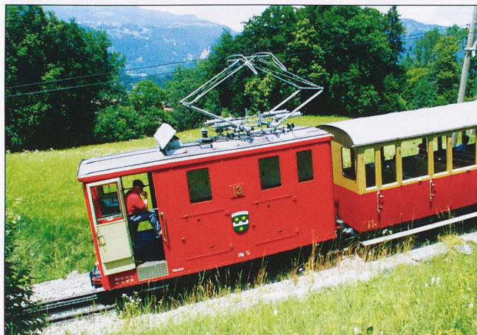
Schynige Platte Loco near Wilderswil.

At the end of August PostAuto Switzerland ordered 145 new buses for a total of CHF50m. Contrary to previous statements made by PostAuto that the future lies in CO2-free buses, 140 of the buses ordered are normal diesel powered, and only five are the more expensive hybrid electro-diesels. Perhaps their financial problems are having an impact here. Pure electrically driven buses may be an alternative in the future and these are currently being trialled by PostAuto. One of these started on the 10th September on the route between Sarnen and Alpnach in Canton Obwalden. The vehicle is a 'Citea SLF-120 Electric' built in the Netherlands by CDL. The 12m long bus has a battery capacity of 180 KWh and can travel a distance of 80 to 90 km between charging. Batteries will be charged overnight in Sarnen bus garage as well as topped up during the short wait at Alpnach Dorf station. However, at the present time, such buses are much more expensive to buy than diesel powered or hybrid ones, and apparently have range and reliability issues on cross-country routes. Massive infrastructure investment would also be required to implement all the charging points needed. Charging also is time-consuming, resulting in longer layovers between services.