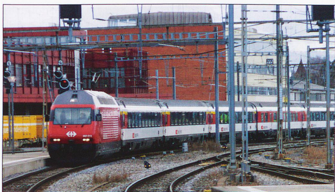
SBB 460 016 entering Thun, with classic train of EW IV cars.