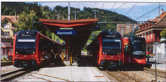
New AB stock lined up at Appenzell.

Under the name 'Limmatalbahn' a light railway is being developed from Zürich Altstetten to Killwangen in Canton Aargau. Stage 1 from Altstetten to Schlieren is currently under construction. There has been considerable opposition to the construction of Stage 2 from Schlieren through Dietikon to Killwangen, but in a referendum on 23rd September the electorate of Canton Zürich voted for Stage 2 to go ahead. There is now much discussion in and around the Baden area as to whether or not the railway should be extended a further 6km into Baden and especially which route it should take. This will be a long drawn-out process and no doubt will require a referendum in the Baden area.