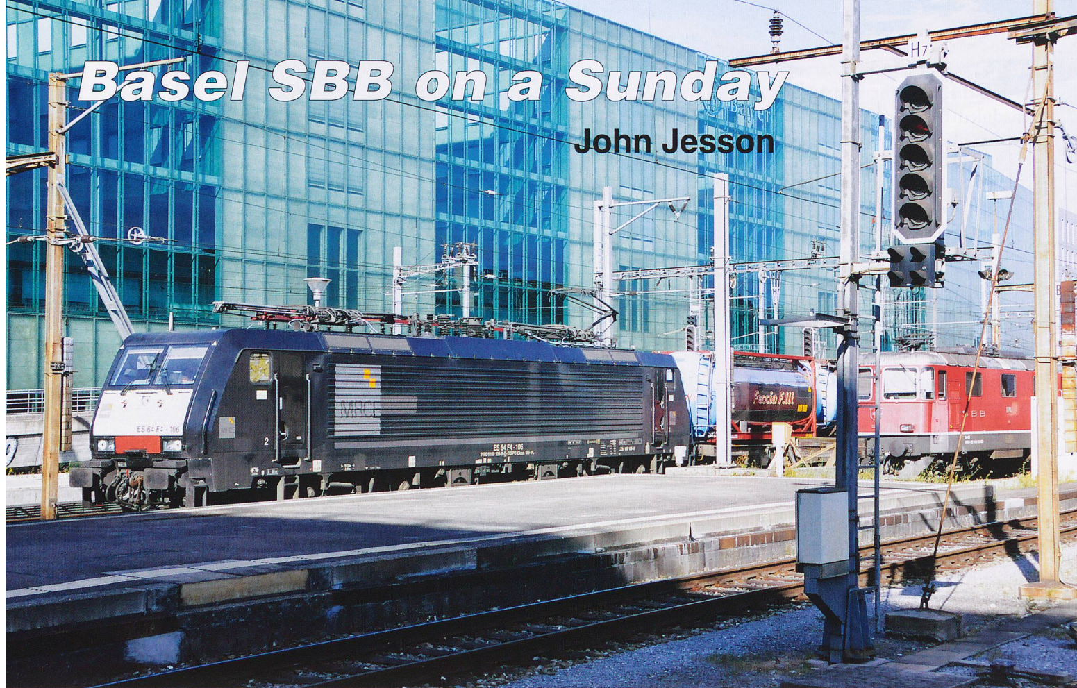
MRCE 189.106 arrives from the MuttENZ direction.