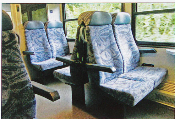
BELOW: The interior of an ABe 2/6.