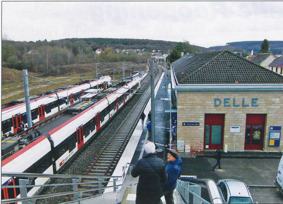
Delle station, with CFF Flirt France units meeting, viewed from the pedestrian bridge crossing the tracks. The station is just a few hundred metres from the Swiss border and the buildings seen in the background are already in Switzerland.