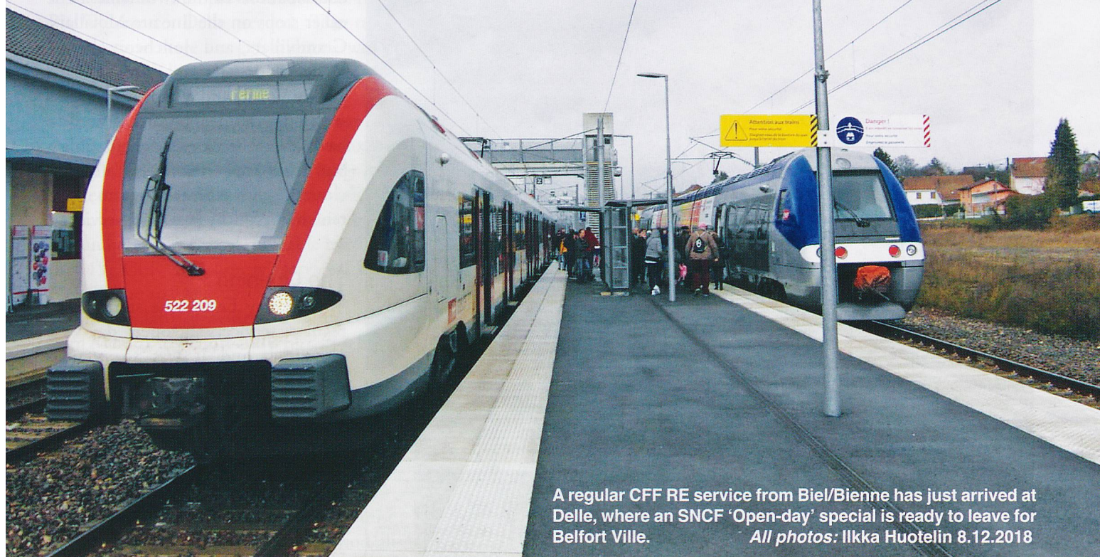
A regular CFF RE service from Biel/Bienne has just arrived at Delle, where an SNCF 'Open-day' special is ready to leave for Belfort Ville.

On the 6th of December 2018 the railway line between Belfort and Delle in the French region of Bourgogne-Franche-Comté was officially re-opened. The general public were invited to celebrate the re-opening with an open day on the 8th, and the next day with the new timetable period, regular passenger services re-started. Whilst the 22 km line is situated entirely within France, the line is important also for Switzerland and its reconstruction was partly financed by the Canton of Jura and the Confederation, as it re-connects the Swiss rail network at Delle to the French one and improves access to the Swiss Jura region.