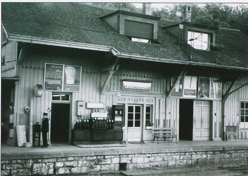
TOP: Ae4/7 No.10987 at Spiez on a Bern train.