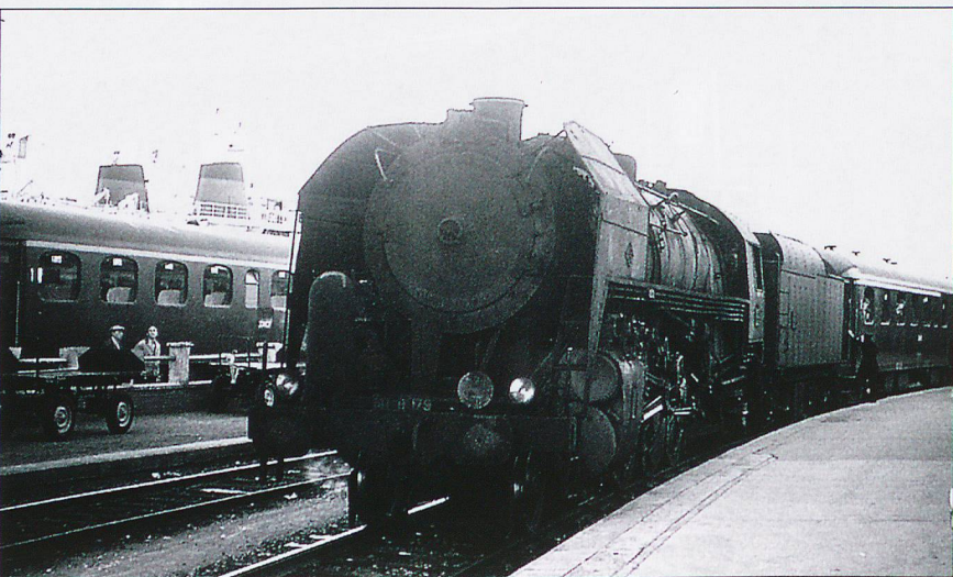
TOP: No.10402 at Zürich HB.