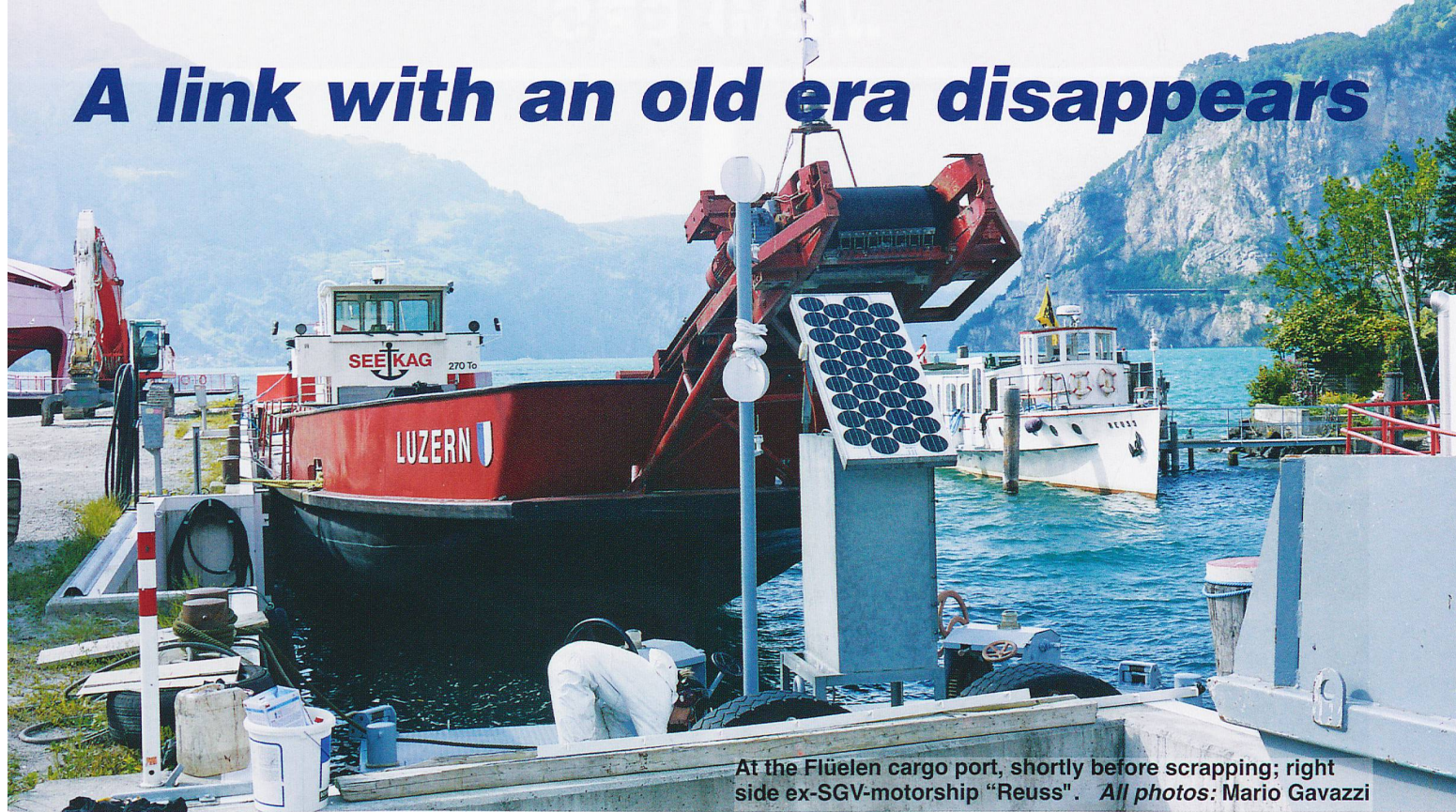
At the Flüelen cargo port, shortly before scrapping; right side ex-SGV-motorship "Reuss".