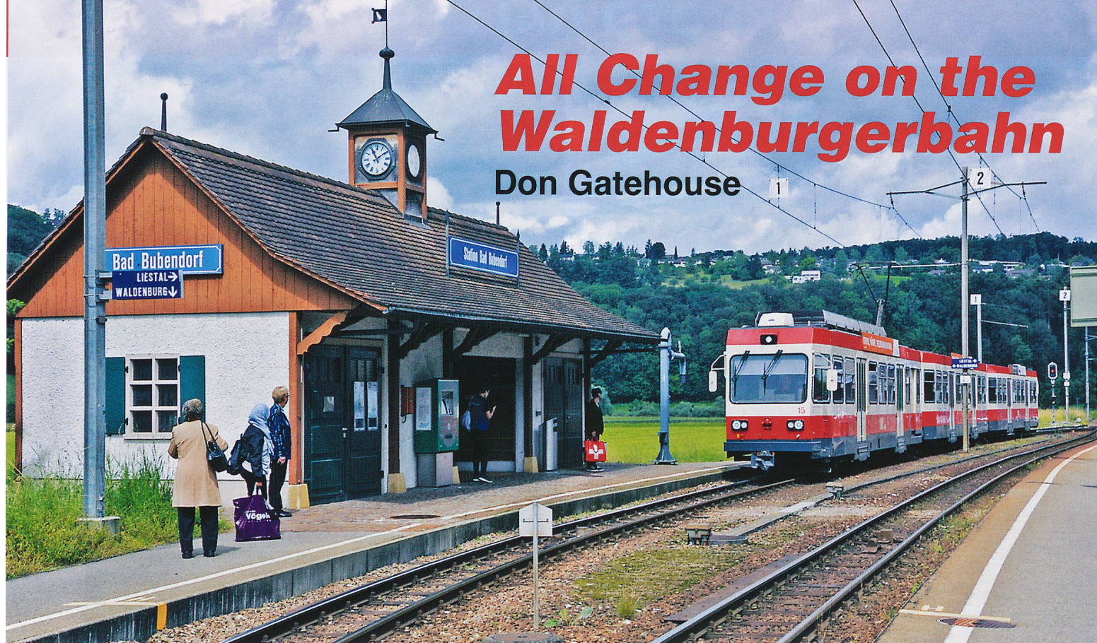
A Waldenburgerbahn services arriving at Bad Bubendorf.