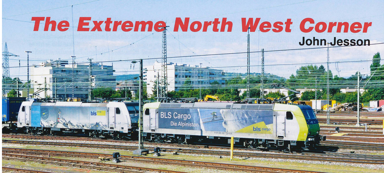
A pair of BLS locos, 485.008 and (Railpool) 186.504 work a southbound intermodal.