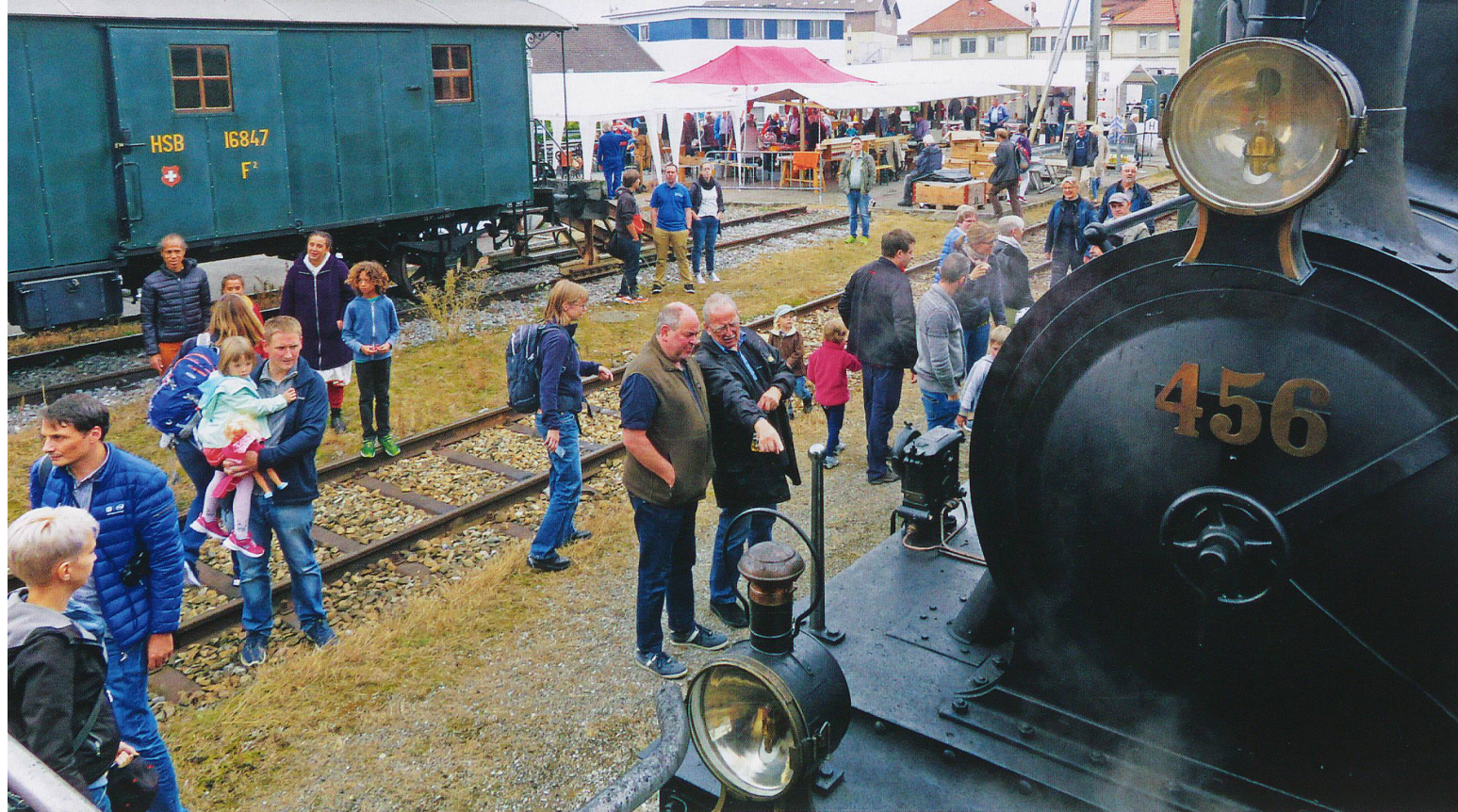
Lots of guests on the area of the Remise at Hochdorf.