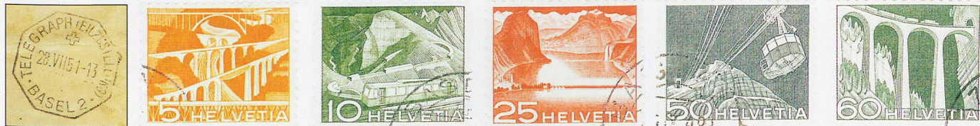
Swiss stamps mostly showing railway themes of the time. Other value stamps can be seen on the envelope opposite.