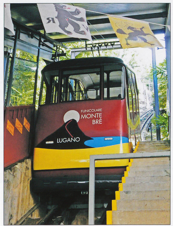
Monte Bré funi - upper section.

This funicular is in two separate sections, separated by a road, which passengers have to cross to get from one to another. The lower section is much shorter at 208m, with a rise of 102m. The journey takes 4 minutes. Despite the short length, it is a conventional single track funicular with two cars and a passing loop. The cars on this section date from 1959. The lower section is effectively a free ride, as tickets are sold at the lower station of the upper section. A turnstile, that allows 42 people through then locks to prevent overcrowding, controls entry. This causes problems when families and groups are separated, as there is no indication of how many