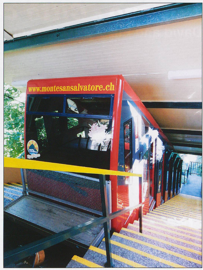
San Salvatore funi - top station.

more people the turnstile will let through.