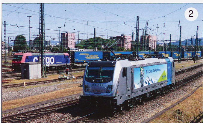
1. SBB 482 000 Basel SBB June 2018 2. Railpool has leased TRAXX vehicles to European operators for 10 years now. Here BLS Cargo 187 004 awaits a turn of duty at Basel Bad in June 2018.

customer was an order for five units from Railpool. A more recent version is the TRAXX AC3 equipped with the Last Mile diesel engine function and is designed to cover all mainline freight applications in continental Europe under 15 and 25 kV AC catenaries.