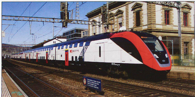
FV Dosto IC200 set 502 009 at Liestal on 25th February operating a Basel to Zürich IR37 service.

SBB ordered 59 trains in 2010 in a CHF1.9bn order, the largest rolling stock order in SBB history. Planned introduction was 2013. Delivery delays and the continuing dispute over disabled access have delayed the process. As compensation for the late delivery Bombardier delivered an additional three units free of charge. (Additional Notes: Bryan Stone)