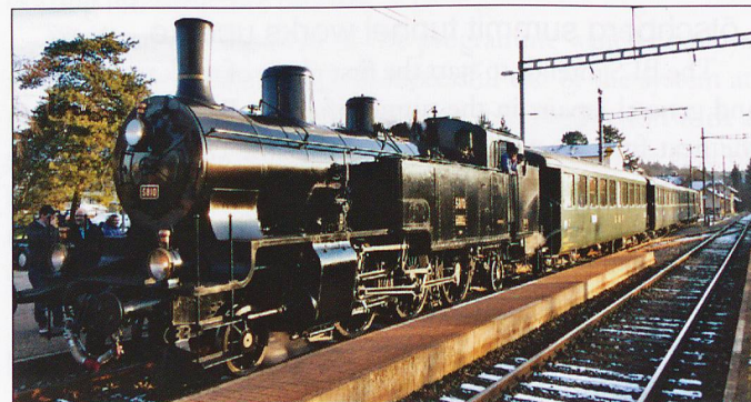
The special at Gerolfingen during a water stop.