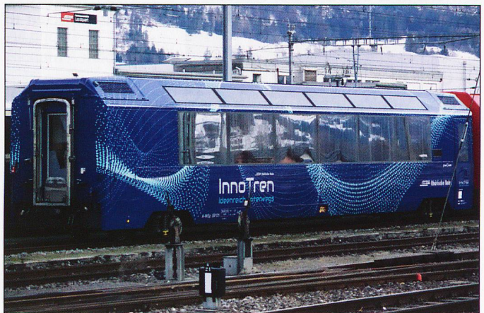
The Innotren carriage at Landquart.

A number of itineraries are offered. For example, for an introductory offer of CHF 765 you can attach the carriage to the 0947 Landquart to Davos Platz.