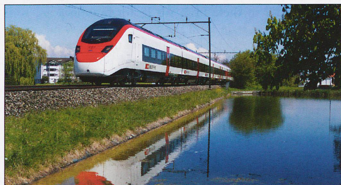
Giruno Class 501

The 11-car units are designed to operate with a top speed of 250 km/h. Stadler won the tender to deliver 29 units by 2019 for CHF980m with an option for up to 92 more. The trains are intended to replace the ETR610 units on the Gotthard base tunnel route between Milano and Basel/Zürich.