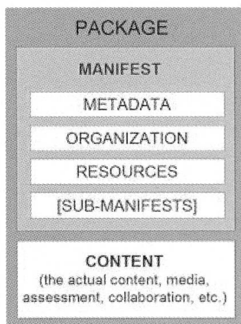
Figure 1: LO Physical Structure (taken from IMS, 2005)

(a) is a straightforward issue, set by LOM and adopted by all standard bodies. For all standards, a LO is a compressed file (e.g. a CAB, TAR, or ZIP file) which contains the content (i.e. the content files) and the metadata, usually coded in XML into a manifest file. The following figure (Figure 1) sketches the structure of a LO according to IMS.