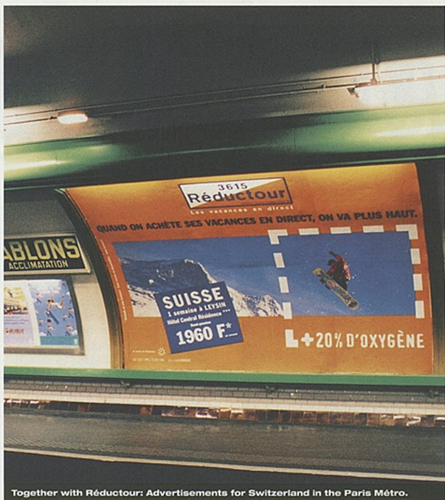
Together with Réductour: Advertisements for Switzerland in the Paris Métro.

Switzerland Tourism Germany signed cooperation agreements with leading tour operators of many different kinds, such as Ameropa, Kipferl's Reisen, Allrounder Reisen, IST Reisen and Action Reisen. Fifteen business plans were concluded in the United Kingdom and Ireland alone: Partners such as Swiss Travel Service, Crystal Holidays and Kuoni Travel recorded increases of more than 20% in overnights in Switzerland, compared with the previous year. In France, Switzerland Tourism had the opportunity of launching a public campaign in the Paris Métro, in collaboration with Réductour. Over a period of fifteen days, 125 strikingly large posters were used to present Switzerland to the Parisian public as an attractive holiday destination. In Spain, the Czech Republic and Italy, Switzerland Tourism also signed cooperation agreements with leading players in the travel business. Switzerland Tourism in North America has likewise committed itself to working closely with Key Accounts: Colette Tours