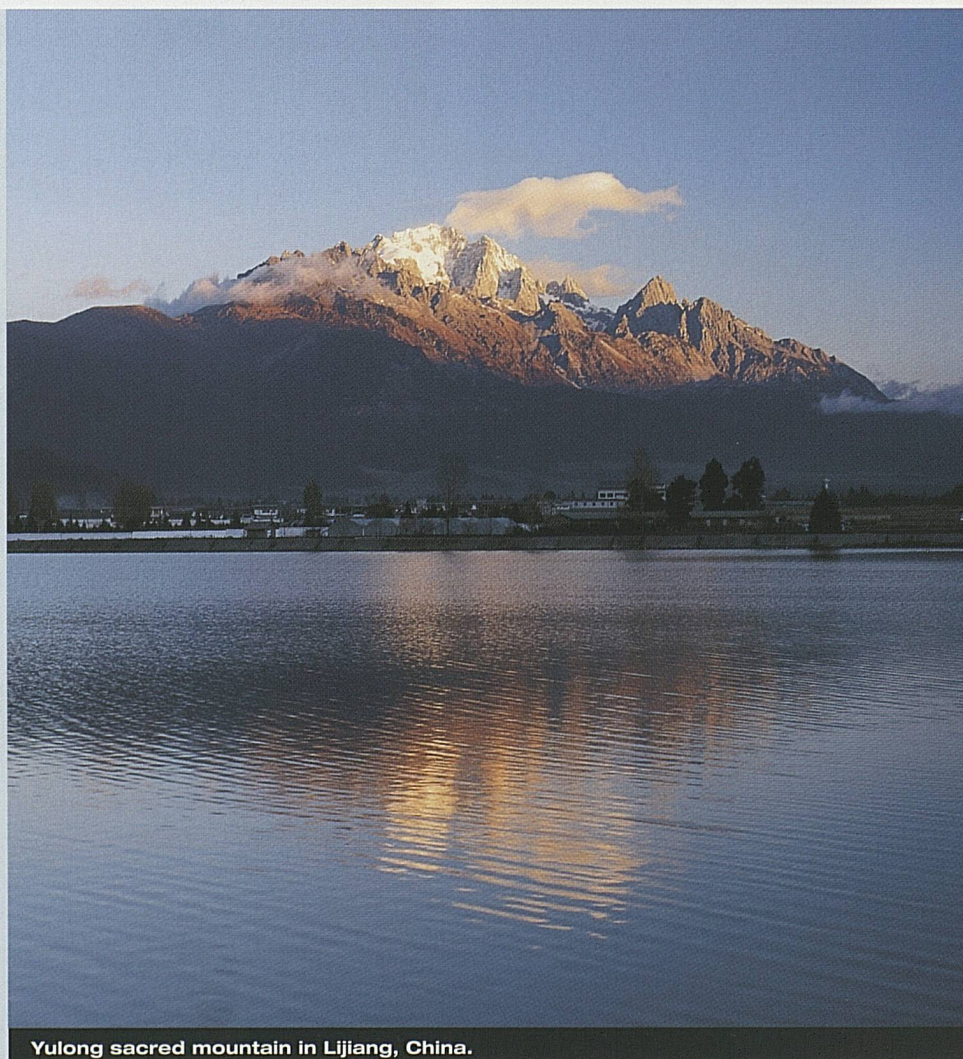
Yulong sacred mountain in Lijiang, China.

The Chinese media, which expressed great enthusiasm for the twinning project, will henceforth be showing an even greater interest in Switzerland and its tourism offerings. Plans are already afoot for television crews from China to visit our country. Moreover, the Chinese are