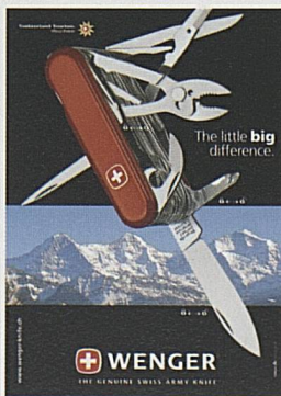
Strategic partners reach potential visitors to Switzerland through their adverts.

The targeted development of new partnership models and forms, stronger integration of partners in marketing activities and rigorous advancement of alternative distribution channels through business partners generates new exposures as well as substantial additional business for the partners. By intensifying these alliances and winning new partners Switzerland Tourism intends to step up its cross-marketing efforts to the benefit of all parties.