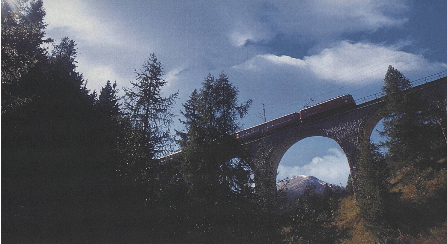
The Rhaetian Railroad.