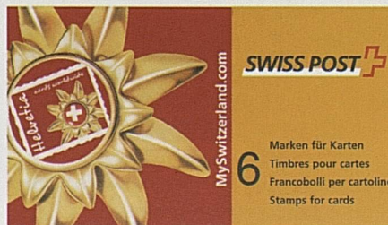
Exclusive stamps from the Swiss post office.