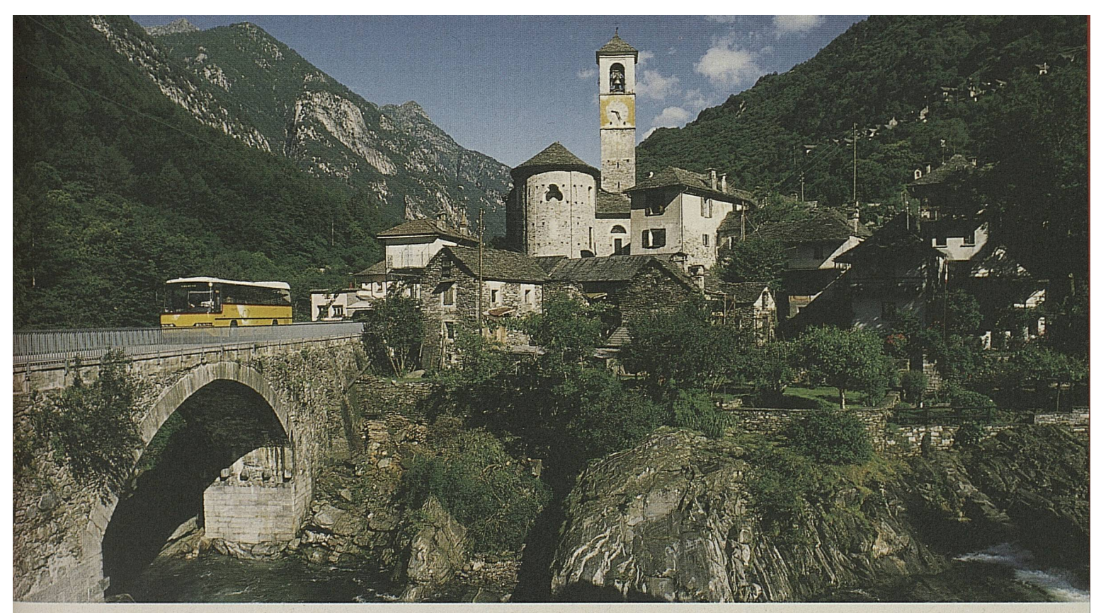
The prospects are great all over Switzerland. As here in Ticino, at the "Ponte dei Salti" in Val Verzasca.