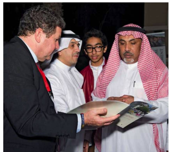
Arab tour operators at a Switzerland workshop.

For three days of wellness, fine dining and heavenly driving roads, Porsche invited 11 Italian automotive journalists on a media trip through Switzerland. ST took care of the programme, which fitted the Porsche image perfectly. The journalists ended up suitably impressed by both Porsche and Switzerland. The articles published up until the end of 2013 reached 4.2 million readers; further stories are planned. ST made important new media contacts.