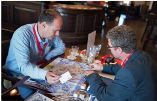
The key points in eight minutes: ST workshop in Amsterdam.