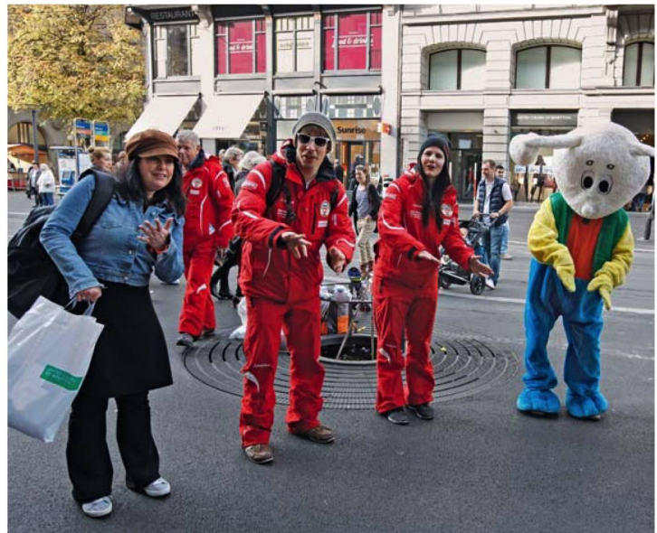
Popular campaign for the start of the winter season: Swiss ski instructors in Zürich offer secret tips.

When it comes to winter, our ski instructors are the top experts. They know the most beautiful downhill runs, the hippest après-ski bars, the cosiest fondue spots and the loveliest chalets. Seven of them gave away their personal secret tips in the booklet “myTop10”, enriched with “augmented reality” (see page 39), in the form of additional interactive and multimedia information on mobile devices with ST’s app Swiss Extend. Visitors could also upload their own tips at MySwitzerland.com/mytop10. This promotion sparked much interest: the myTop10 microsite had generated 616,000 site views by year’s end.