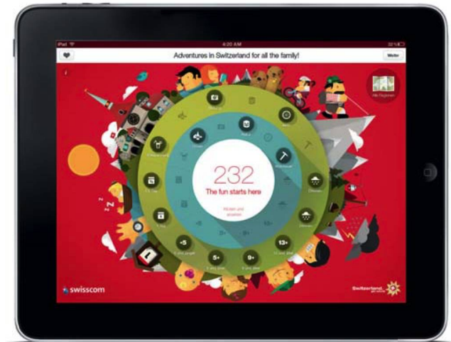
Multiple awards at “Best of Swiss Web 2013”: the “Family Trips” app by ST and Swisscom.

“Family Trips” is as spontaneous and full of surprises as everyday family life. This multi-award-winning app for mobile devices was developed by ST and Swisscom to promote Switzerland for family adventures. Beneath a brightly coloured user interface, it playfully presents 1,200 family adventures. With filters such as “weather”, “age of children” and “duration”, the tips can be sorted to suit everyone’s needs. The app has been downloaded a total of 70,000 times.