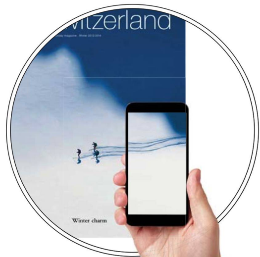
Thanks to ST’s app Swiss Extend, a magazine becomes a film.

At the Mountain Travel Symposium (MTS) in Aspen, Colorado, 1,200 people played cow bingo. ST organised the event, with St. Moritz, Interlaken/Jungfrau Railway, Engelberg/Titlis and Valais as partners. MTS is North America’s most important winter tourism conference. Tour operators from the US, UK, Canada, South America, Australia and New Zealand come here to swap ideas. Switzerland positioned itself as the top winter destination at the one-week event. Cow bingo was the talk of the show.