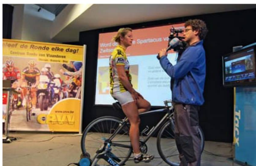
At the Spartacus media conference in Ghent, brave Cancellara fans measured up.