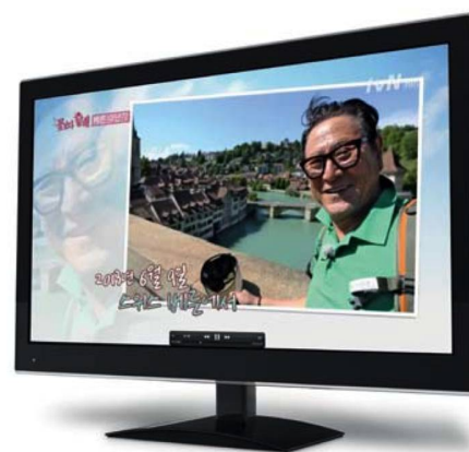
Enthralled Koreans: TV show "Gramps Over Flowers".