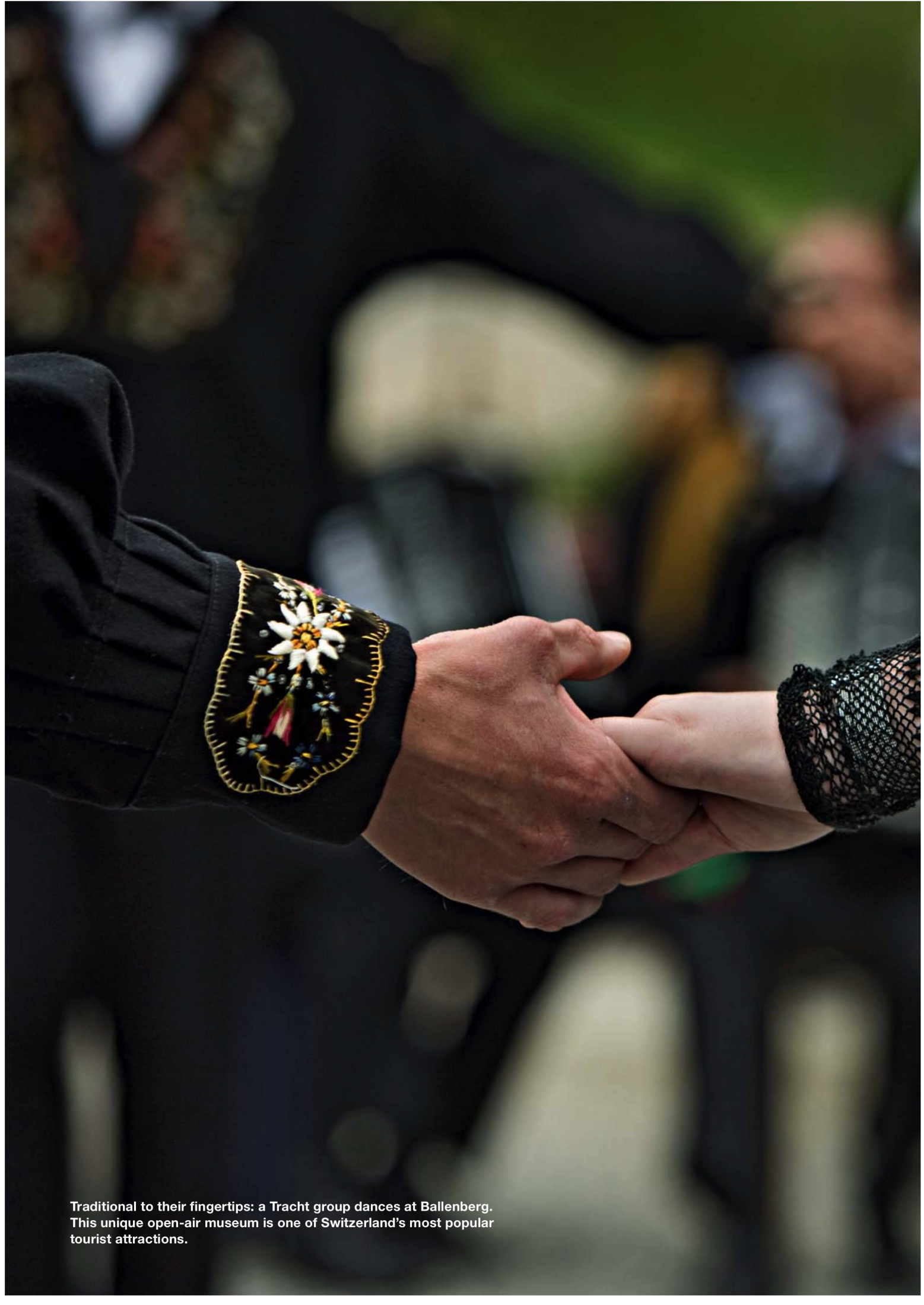
Traditional to their fingertips: a Tracht group dances at Ballenberg. This unique open-air museum is one of Switzerland's most popular tourist attractions.