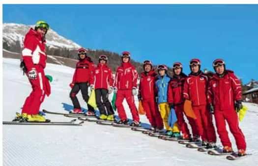
Chinese ski instructors training in Celerina, Graubünden.

Charming, high-spirited and tanned: on 26 October, 550 Swiss ski instructors from 75 winter sports destinations mingled with the public in Zürich, Bern and Lausanne, offering secret tips and stimulating interest in a Swiss winter sport adventure. 16,000 “myTop10” booklets were distributed to people in stations, shopping malls and pavement cafés. It was a well-received promotion by ST and Swiss Snowsports to mark the start of the winter season. The official winter launch followed two days later at media conferences in Zürich and Lausanne.