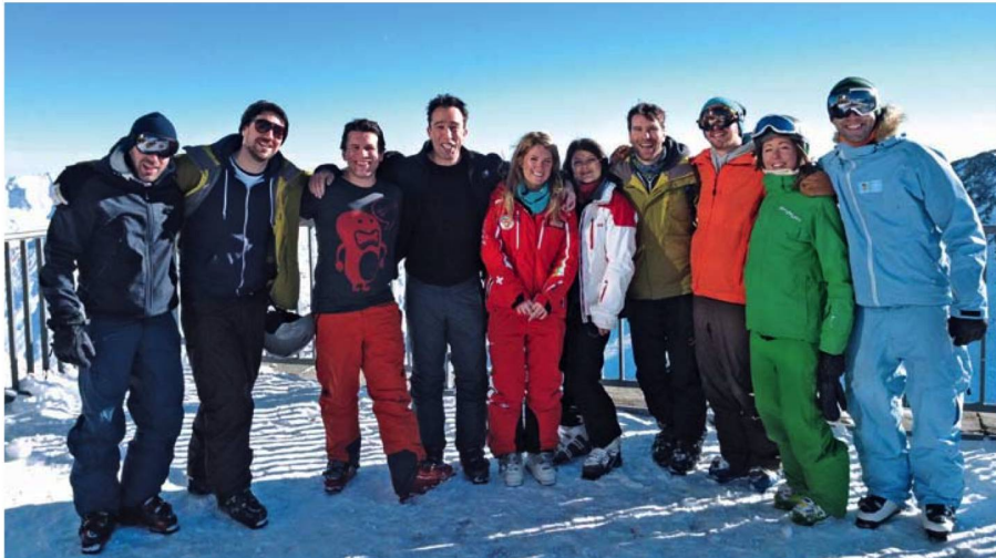
The Absolute Radio crew visibly (and audibly) enjoying Switzerland.