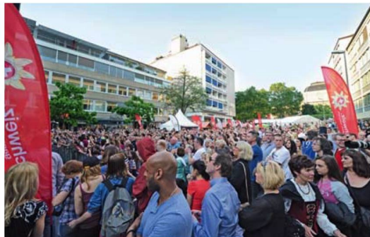
Great interest in Switzerland: the street fair in Wiesbaden.