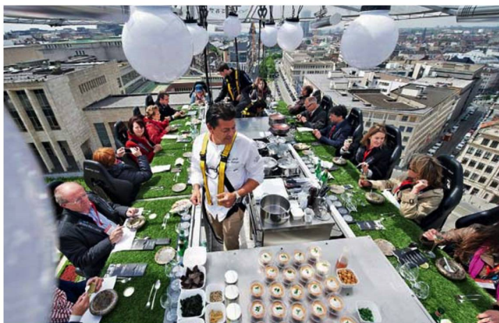
Heavenly dining experience: networking event "Dinner in the Sky" in Brussels with important decision-makers.