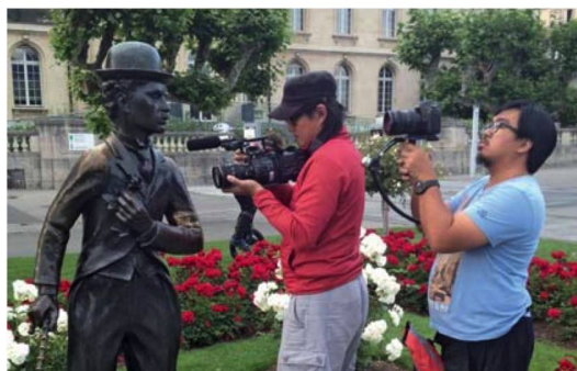
Charlie Chaplin in their sights: a Malaysian TV shoot in Vevey.

The TV series “Travelodge” is enormously popular in Malaysia. In 2013 the entire 13-episode season took place in Switzerland. ST assisted in the organisation of the filming over three months, which covered all of Switzerland's tourism regions, as well as this year's theme “Living traditions”. Each “Travelodge” episode reaches over 200,000 viewers interested in travel. ST assembled new itineraries, promoted them around the series and estimated over 500 bookings, amounting to 6,000 overnights.