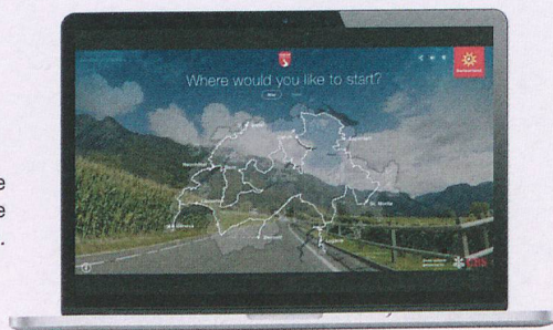
Almost like the real thing: the Grand Tour online.

*** Number of E-newsletter subscribers, contacts via the call centre (phone calls, emails, letters), brochure requests and downloads, travellers booking at STC / MySwitzerland.com, respondents via MySwitzerland.com, STC and tour operators, app downloads, feedback / likes on Facebook, followers on Twitter