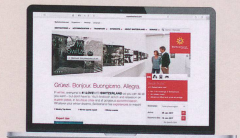
MySwitzerland.com set a new record, with over 30 million visits.

** Number of followers on Facebook, Twitter, YouTube, Pinterest, Instagram, Tumblr, LinkedIn, Vine, Weibo, Ren Ren, Google+, WeChat