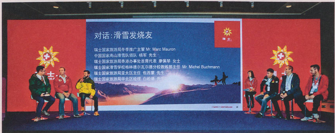
ST presents the Swiss winter at the first World Winter Sports Expo in Beijing.