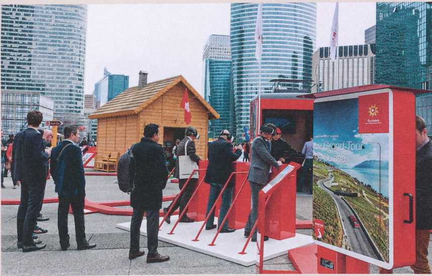
An interactive journey through Switzerland as a touring destination in Paris.