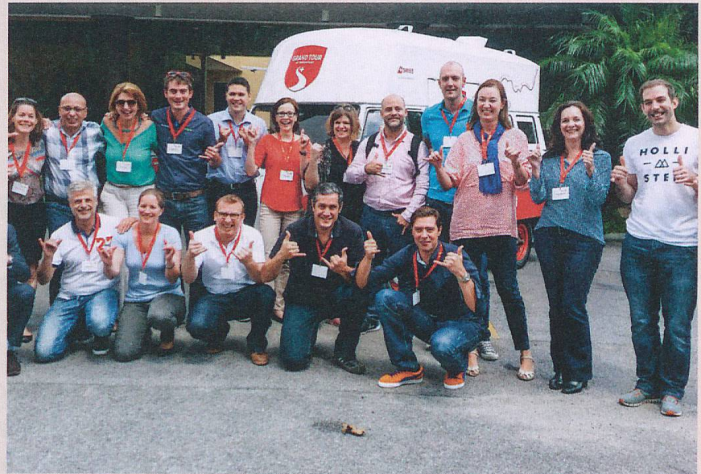
The new concept of the STE Brazil has been very well received by tourism partners.