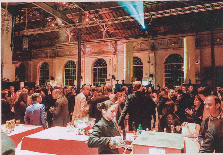
The Bâtiment des Forces Motrices (BFM) in Geneva where a night-time event for the International Moving Industry (FIDI) was held.

Europe is decreasing. In order to compensate for this decline, the Switzerland Convention and Incentive Bureau (SCIB) has continued to promote diversification with regard to the variety of markets and types of meetings. For example, there is great potential in incentives, particularly in Asia, and in congresses for associations. These tend to be less price-sensitive and Switzerland profits from its good image. In 2016 the SCIB was able to help many congresses come to Switzerland, the Association for Physiotherapy with 5,000 participants, and the conference of the International Moving Industry (FIDI) with 600 participants, among others. Together with other meetings and incentive trips, 2016 saw 1,479 offers processed and 797 meetings held in Switzerland.