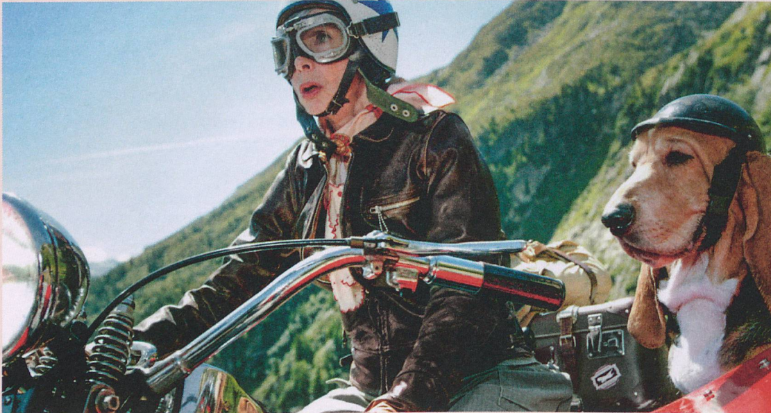
In the 2016 Summer campaign, "Lady Victoria" and her dog, Maurice, experience beautiful moments on the Grand Tour.

beautiful landscapes, she also experienced unforgettable personal moments, such as leaping into an emerald-green lake or having an impromptu lunch with the locals. The message: on the Grand Tour you can discover the happiness of the Swiss and be a part of it. In summer 2016, the Grand Tour generated over 290,000 additional overnights and reached a brand awareness of 43% in only its second season.