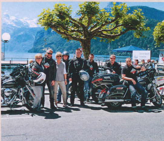
Polish journalists discover the Grand Tour of Switzerland on Harley-Davidsons – with a stopover in Brunnen, Schwyz.

*Positive media reports with prominent placing, images and tourist content, which appear in a key medium