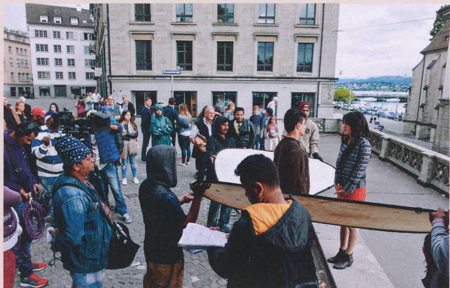
ST assisted the 34-strong Indian film crew and their one ton of equipment on the journey through Switzerland – as here in Zurich.