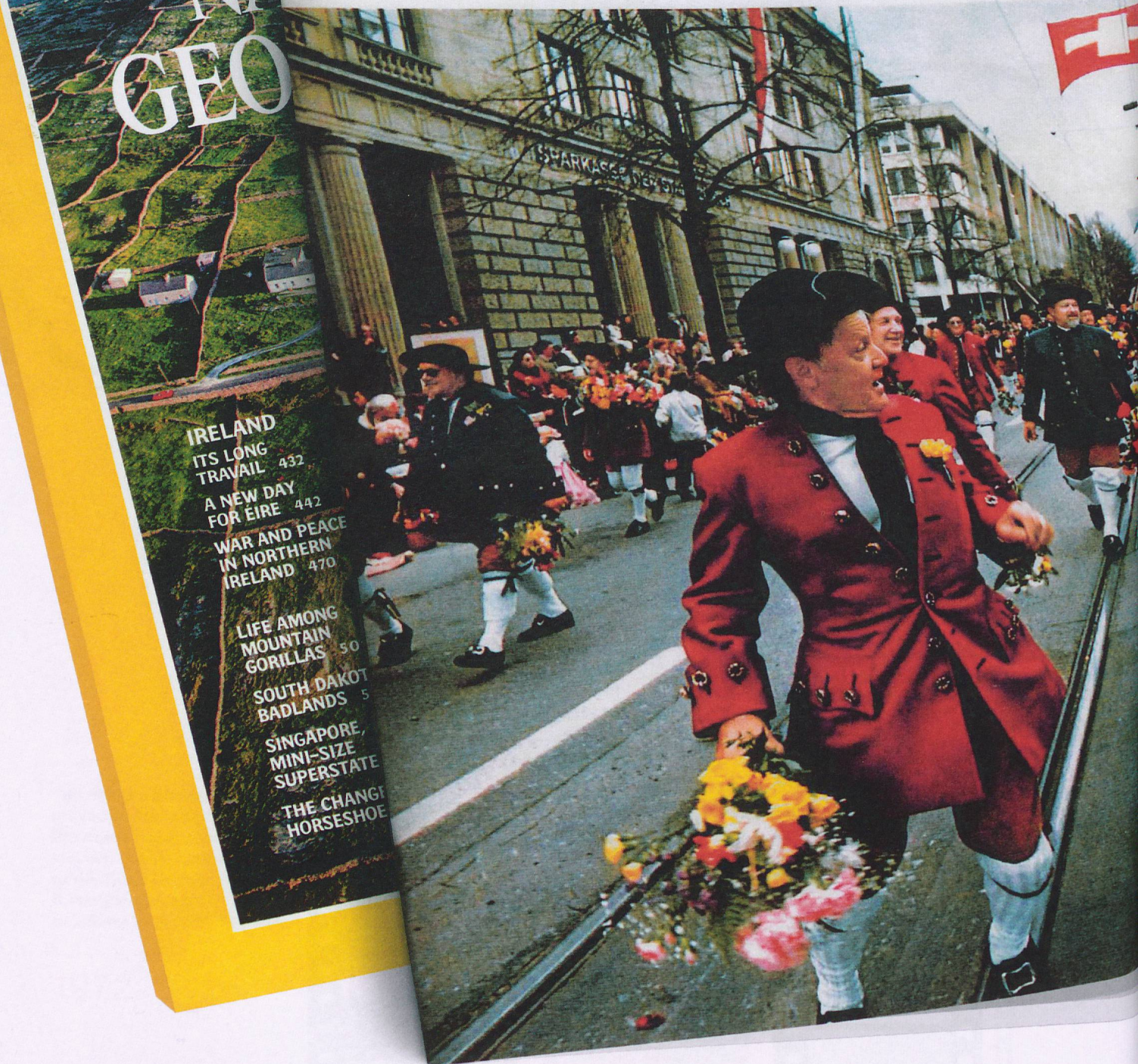
The result of many years of media relations work: Destination Switzerland as a supplement in "National Geographic".