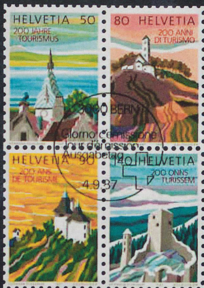
As part of the close collaboration with the Swiss Post, the SNTO celebrated 200 years of tourism in Switzerland with special stamps in the 1980s.