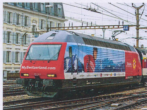
Strategic partnerships: exploiting synergies and taking the image of Switzerland out into the world together.