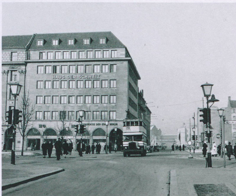
Switzerland House in Berlin: firmly in Swiss hands, even during World War II.