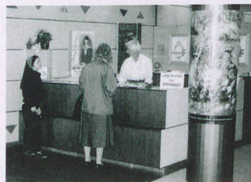
The SNTO opened a new office in Stockholm , to market Switzerland as a holiday destination in Scandinavia. After a short break, today Switzerland Tourism once again has a presence in Sweden.