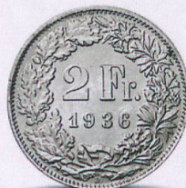
In light of the economic situation, the government devalued the Swiss franc.