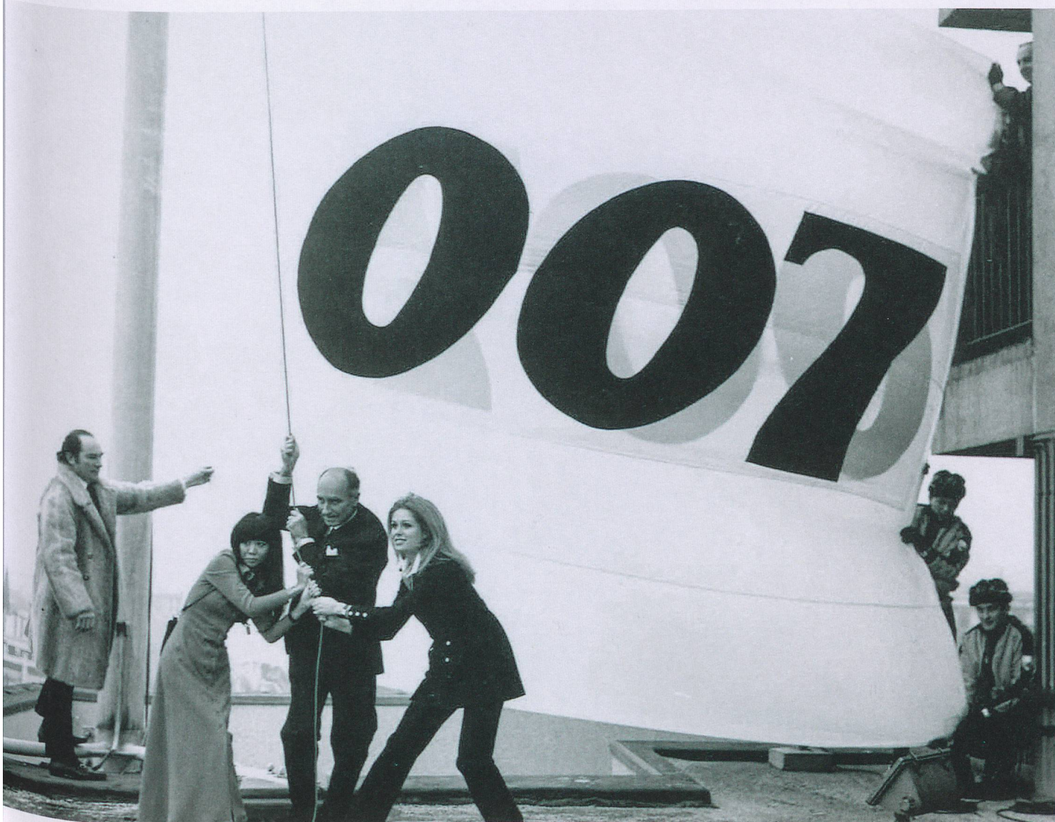
007 on the roof of the Swiss Centre, London: promotion in Britain for the new Bond film set in Switzerland.