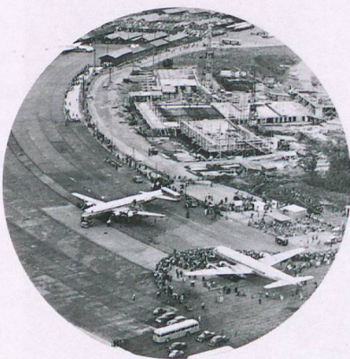
A new chapter for Swiss tourism began with the construction of Zurich International Airport .

Creative inspiration was already in demand in the crisis-ridden 1930s, when the image of Switzerland as an expensive enclave weighed heavily on the entire country. Quick as a flash, motor tourists were tempted into Switzerland with "cut-price tourist petrol", package offers were created for "wedding couples", and fees for mountain guides were brought down. In the 1970s, amidst the oil crisis, Switzerland's creative tourism minds were once again put to the test. SNTO director Kämpfen's rallying cry was loud and clear: "Attack is the best form of defence!" Within a short time a catalogue of 300 summer offers was created, and a new hotel guide was distributed to all Swissair passengers. Messages such as "Switzerland – treat your money to a well-earned holiday" clearly set out the way in which Switzerland intended to sell itself. Campaigns courted quality-conscious individual travellers with "Tailor-made holidays, not mass tourism".