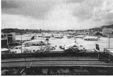
Illustration: 2A. Hong Kong Airport: Andreas Gursky, 1994