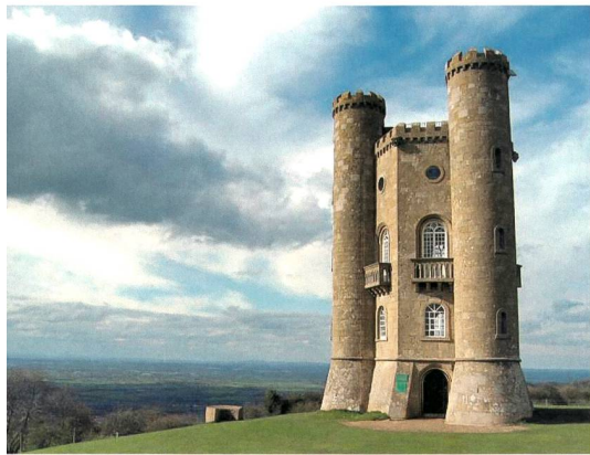
Garden Folly: James Wyatt, Broadway Tower, Cotswolds, 1797, state 2004