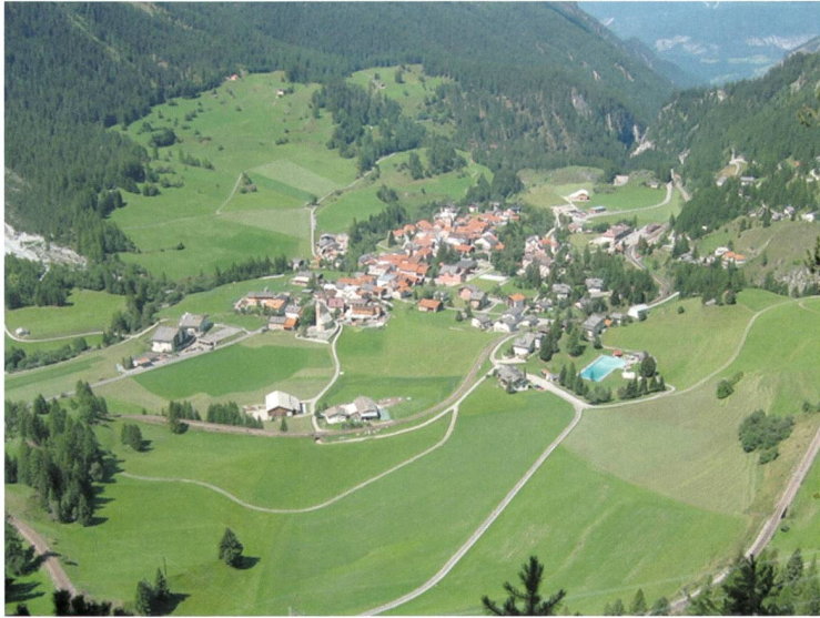
Bergün , aerial view, state 2005, photo by Edvin Bylander.