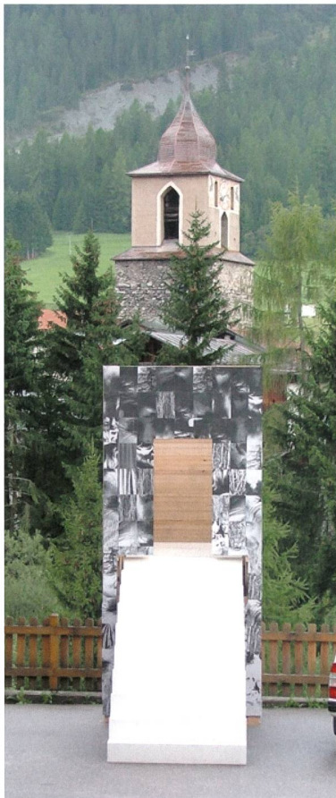
Workshop participants, Folly Suisse , Bergün, 2005, photo by Benedikt Boucsein.