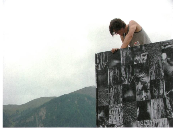
Workshop participants, Folly Suisse , construction photo, Bergün, 2005, photo by Benedikt Boucsein.