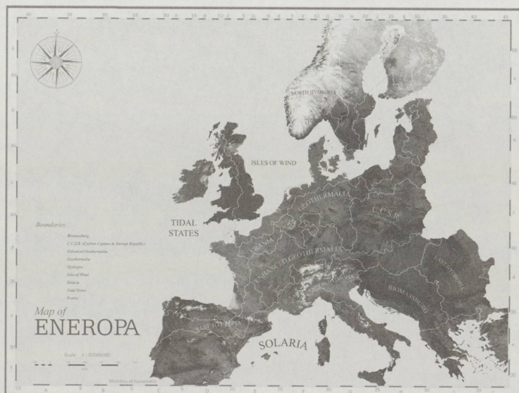
fig. b 'Map of Eneropa', Roadmap 2050, 2010. © OMA

is that clients who initially approached us for an architectural commission also understand that we can contribute in other ways. We have a long collaboration with Prada, for example, which is exemplary of the range of work which includes not only architectural projects (their stores and a museum), but also fashion shows, publications, and even some work on their website.