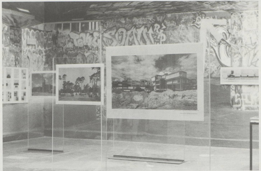
fig. a 'Public Works', Venice Architecture Biennale, 2012.

It's fascinating when you see what was made possible through the integration of design and policy into one single function. I