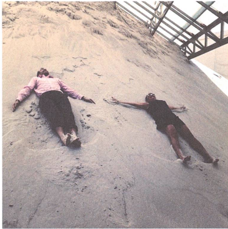
fig. c ‹Tent Pile›, 2013. Photography: Formlessfinder.