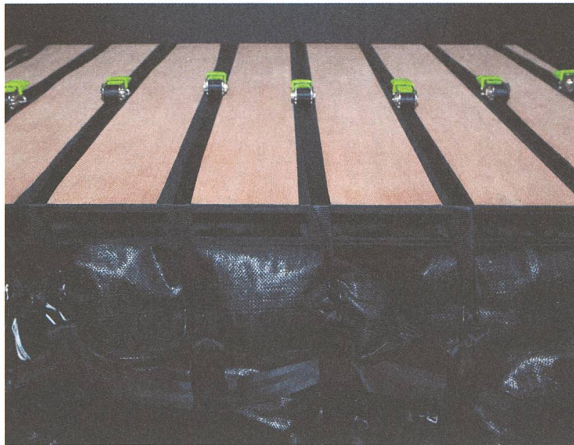
fig. e Table Net, 2014.