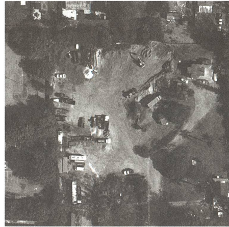
fig. d Sand supply, as found.

tive findings have come from looking at infrastructure. Like many of the most interesting found conditions, infrastructure tends to go unnoticed (often we don't give it any thought until it's broken). What appeals to us, though, is that infrastructural projects often deal with materials that are raw and ubiquitous, at a massive scale that demands a kind of rugged pragmatism and simplicity. Much current experimental work in architecture is based on speculation about scaling up, particularly in the realm of digital fabrication, where processes now used to make design objects and architectural fragments may one day produce buildings. But while it may take decades for such theoretical possibilities to become reality, infrastructural techniques can be easily scaled down to architecture – with immediate application.