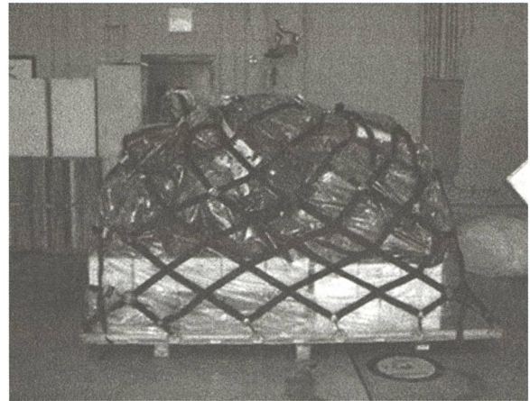
fig. f Netting system for airfreight, as found.

These kinds of materials and processes are cheap and easy; their results are unexpected and immeasurably complex. They also provide a way of expanding architecture beyond traditional disciplinary boundaries, shifting the economic and social conditions of its production and use. Through infrastructure, architecture can be linked to worldwide flows of goods and materials, and perhaps begin to address the needs of a more diverse global audience.