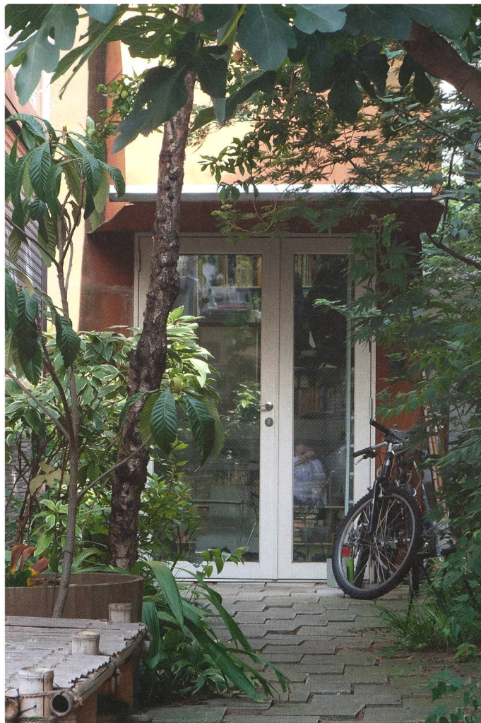
fig. a Atelier Bow-Wow, House and Atelier Bow-Wow, Tokyo 2005, Entrance, state in 2016.