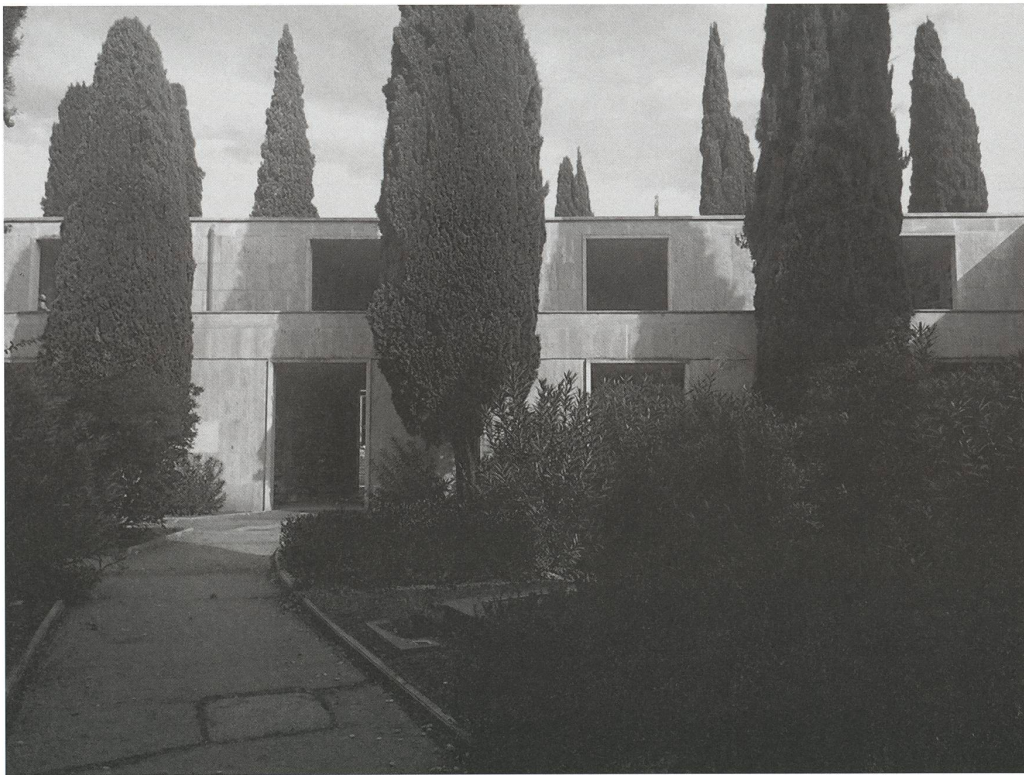
fig. a photographed by the author, 2015