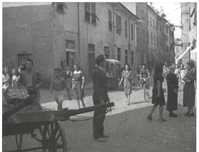
fig. f Scene from Luchino Visconti (director), «Osessione», 1943