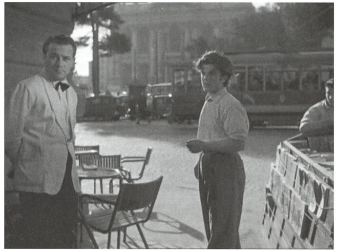
fig. d, e Scene from Renato Castellani (director), «Sotto il sole di Roma», 1948