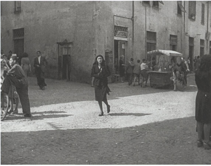
fig. g Scene from Luchino Visconti (director), «Osessione» , 1943