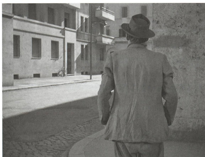
fig. b, c Scene from Vittorio DeSica (director), «Ladri di biciclette», 1948