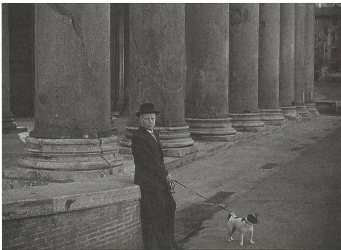
fig. h, i Scene from Vittorio DeSica (director), «Umberto D.» , 1952

shortly after Giovanna, who is following him, arrives at a bar. The aim of this scene is to show, in a concise yet profound way, the urban life of the Italian city around just any corner, in the style of a documentary. Therefore, the location, actors and action are of little importance, as it is precisely about detaching oneself from all of that and revealing several phenomena from those years associated with the meeting between streets. Besides Gino and Giovanna there is the corner, housing a store. A number of children, some sitting using a projection as a bench, are at the corner. A parked cart is also visible in the foreground and, at medium distance, a mobile kiosk is positioned in the middle of the street. Hard, uniform pavement makes up all the space that is filmed, and it is only coloured by the sun that peeks through between the buildings. The open windows and unfurled awnings signal good weather and openness between the houses and the street. Finally, the people: couples, families, elderly people with children, groups of elderly women standing, children on their own, women, disabled people and people on bicycles continuously pass before the camera (fig. f, g). The huge mass of people that appears seems to have been deliberately chosen so as to be all different in terms of clothing, age and groupings. This is obviously another aspect in the minute detail of the scene.